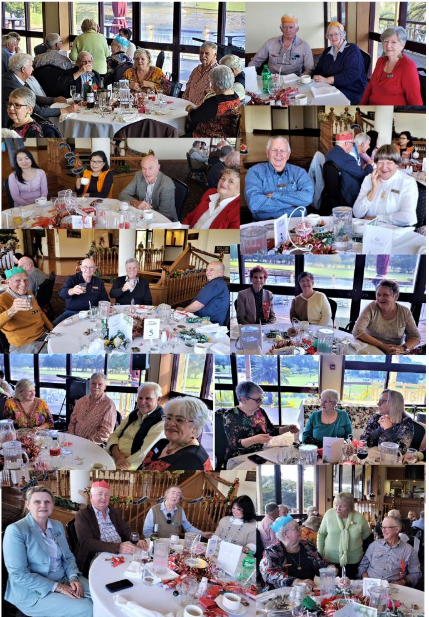
Christmas in July Lunch at Palmer Golf Club