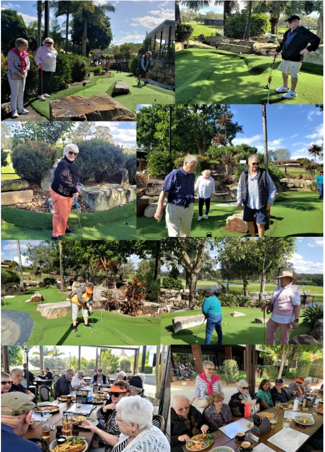
Mini Golf at Parkwood