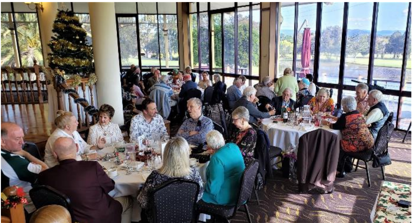
Christmas in July Lunch at Palmer Colonial Golf Club