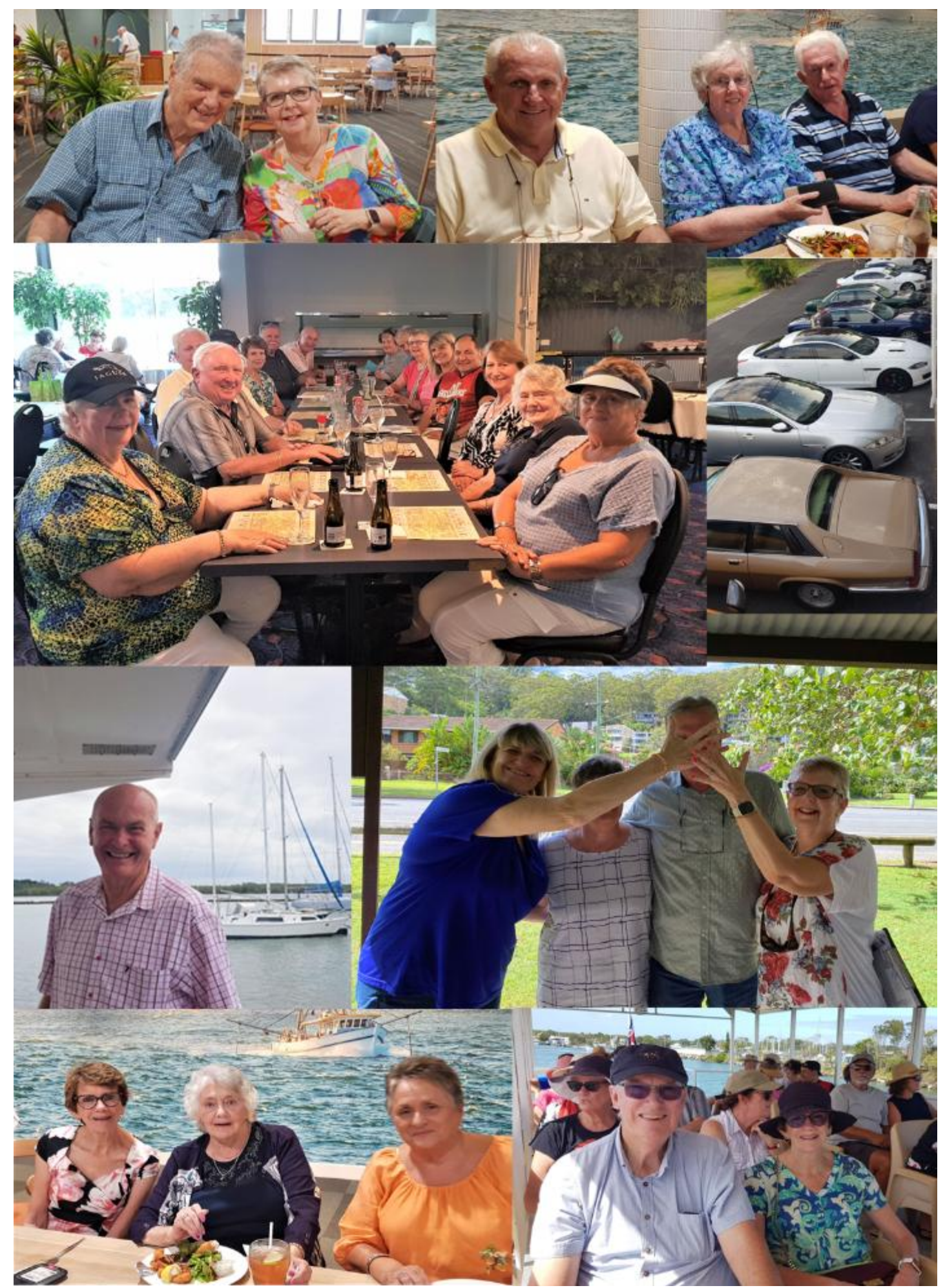
The Trip to Yamba 2