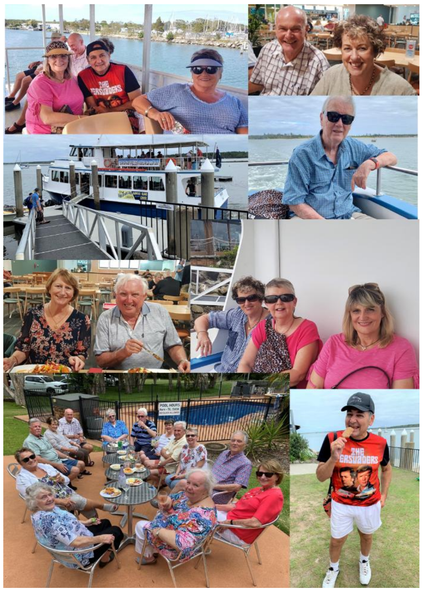
More Photos of the Yamba Trip