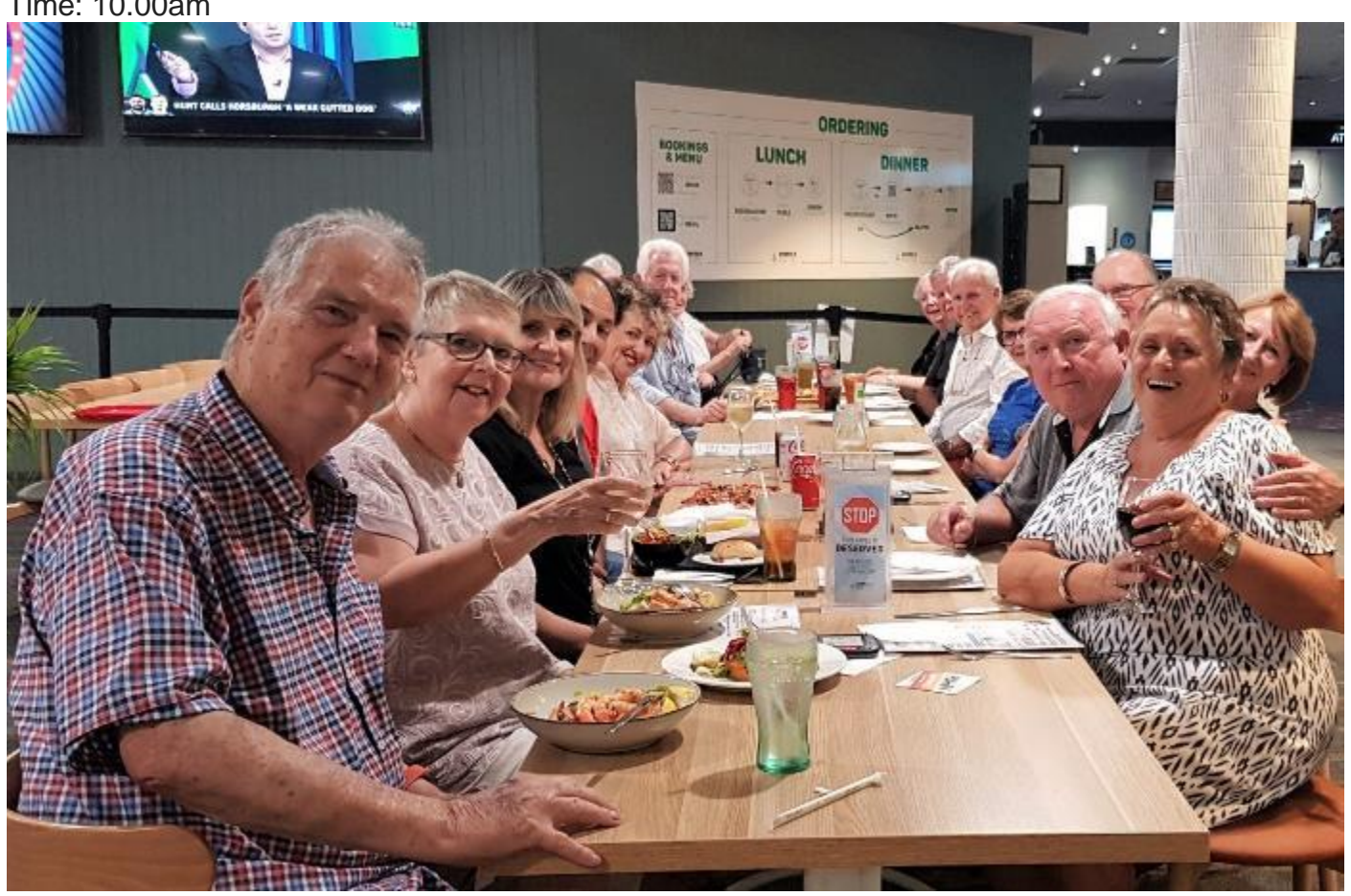
Lunch on the Yamba Trip