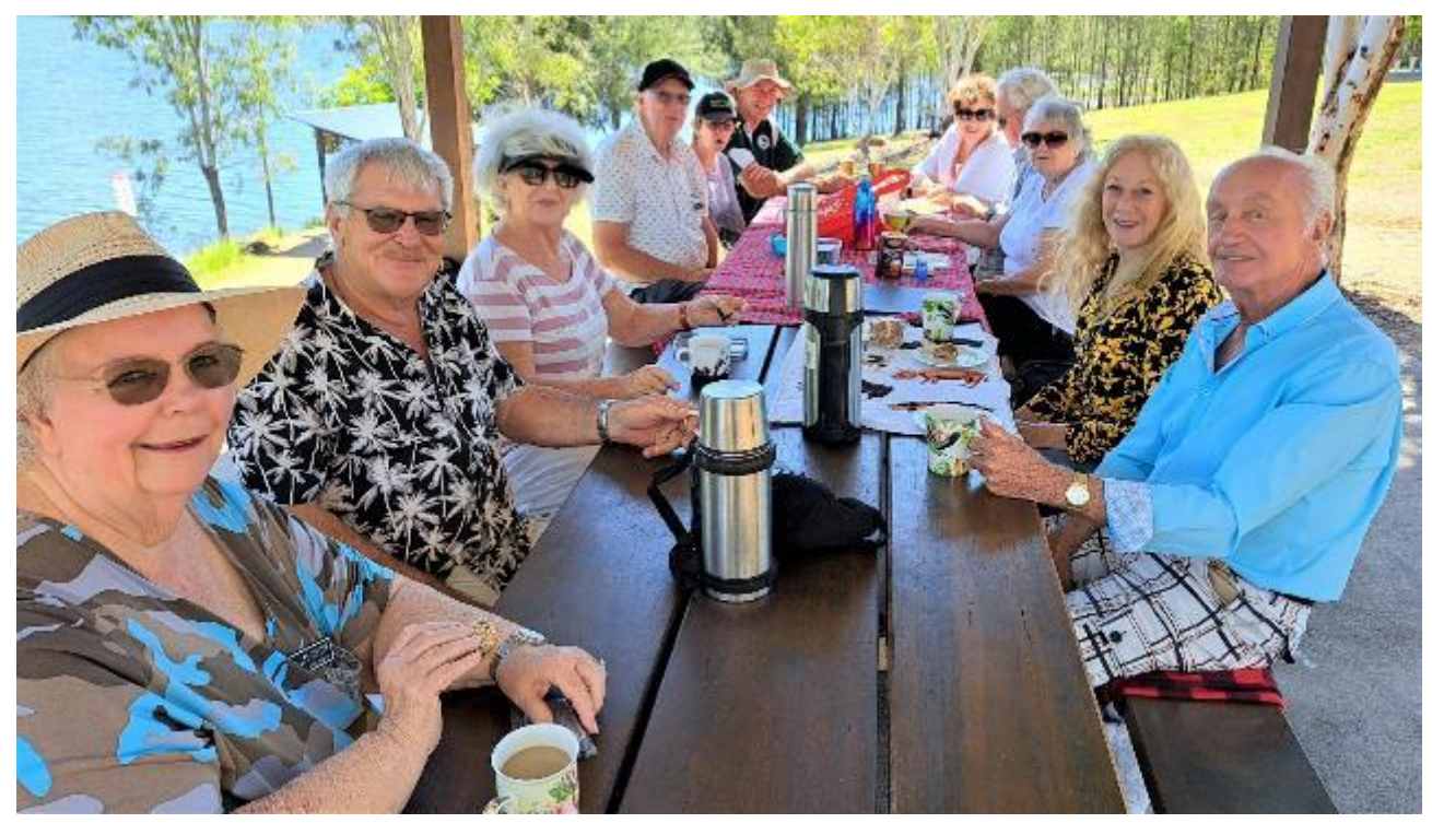
Morning Tea at Wyaralong Dam