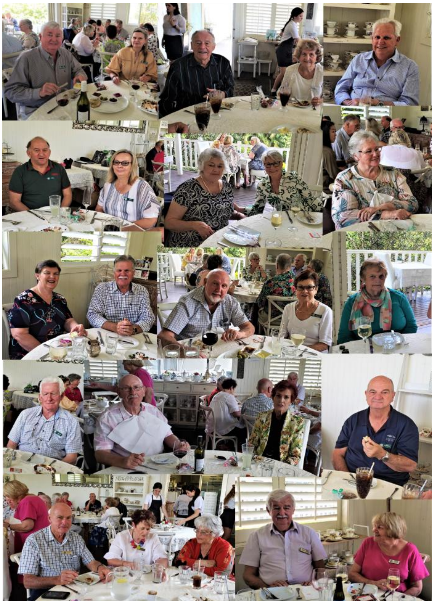
Lunch at Teavine House Tullebudgera