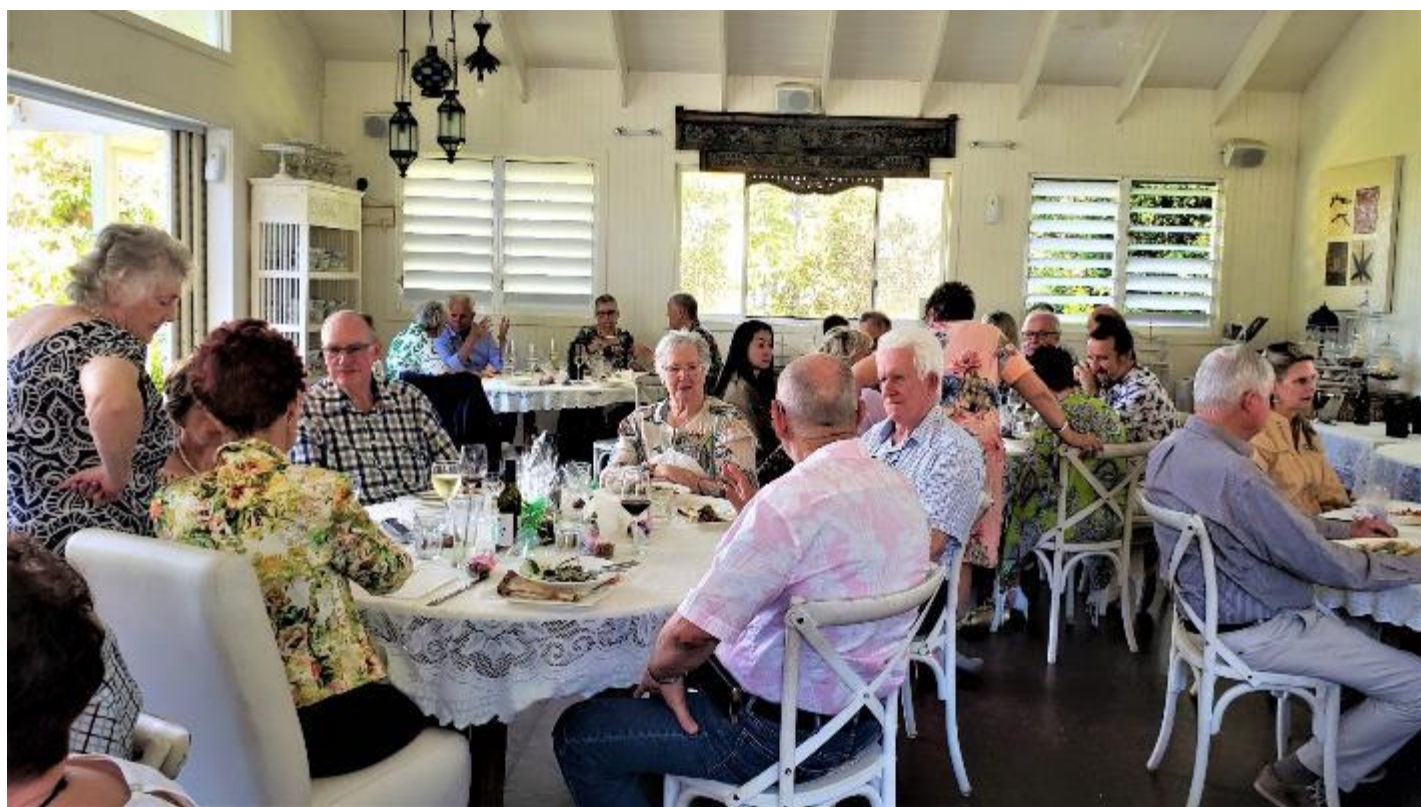
Lunch at Teavine House Tullebudgera

Australia Day 2023 – See page 6 for details.