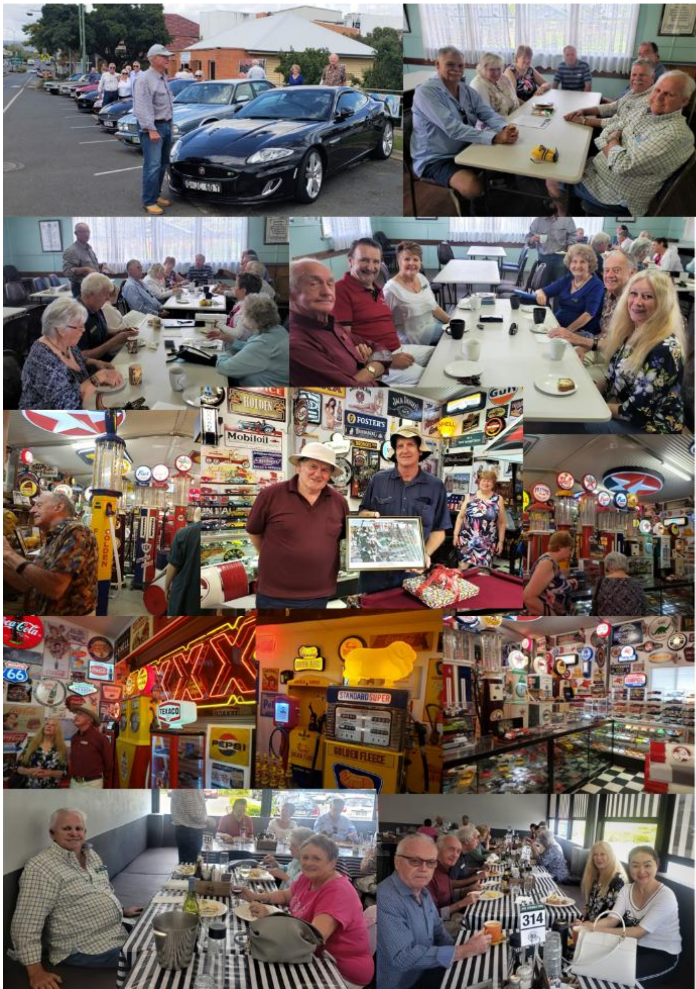
Morning Tea & Lunch in Beaudesert & Memorabilia Display at the One Way Shed