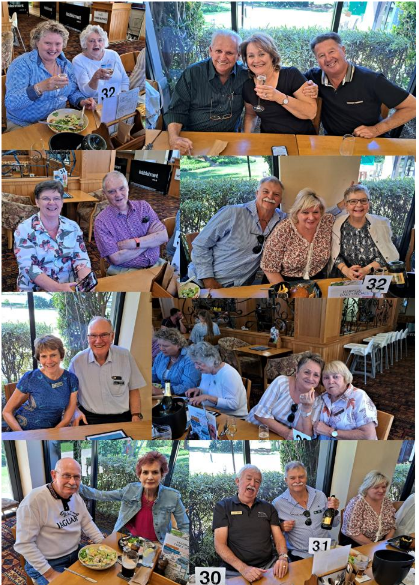
Lunch at Harrigan's Irish Pub at Jacob's Wells