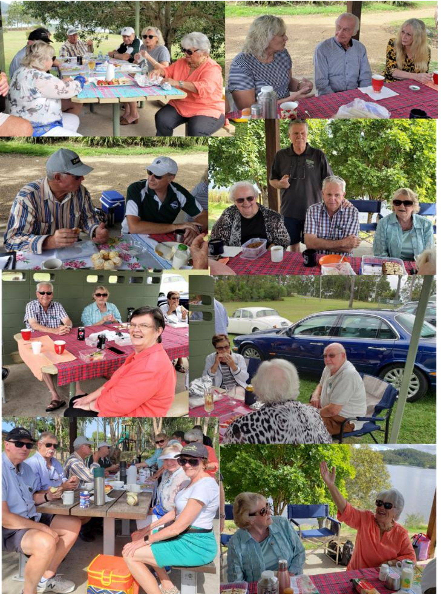
Wednesday Run to the Maroon Dam