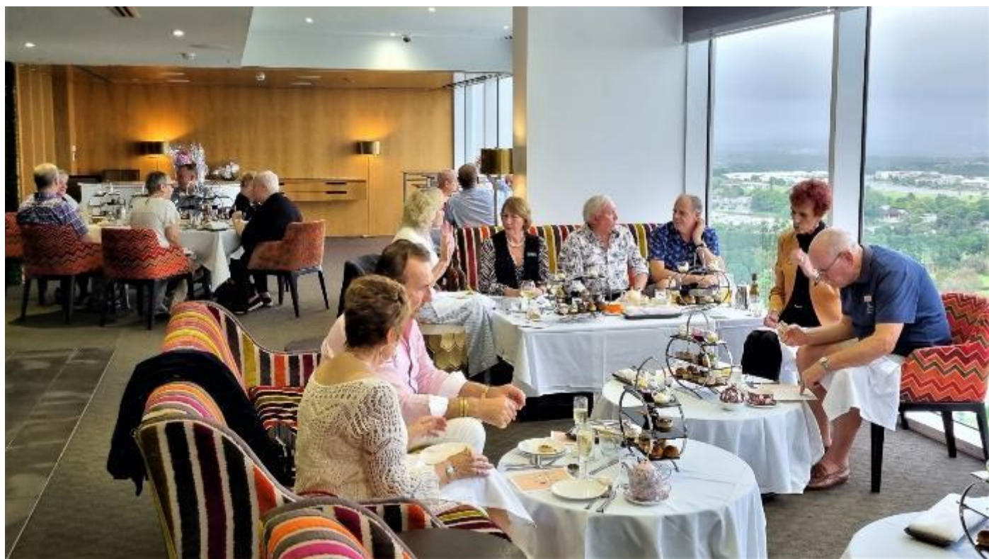
High Tea at the RACV Royal Pines Resort

For this year's Christmas in July see page 6.