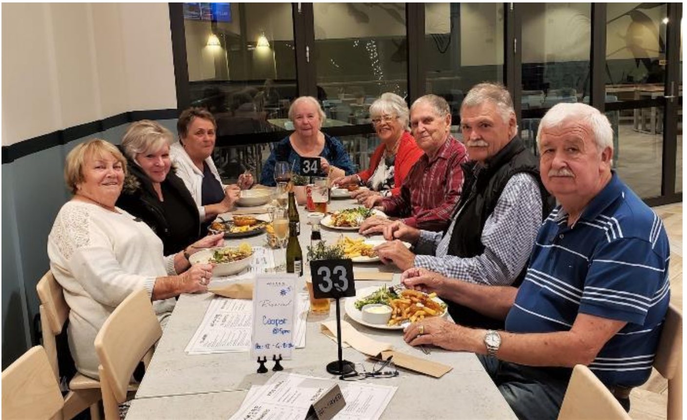
Dinner Before the Meeting at the Ashmore Tavern