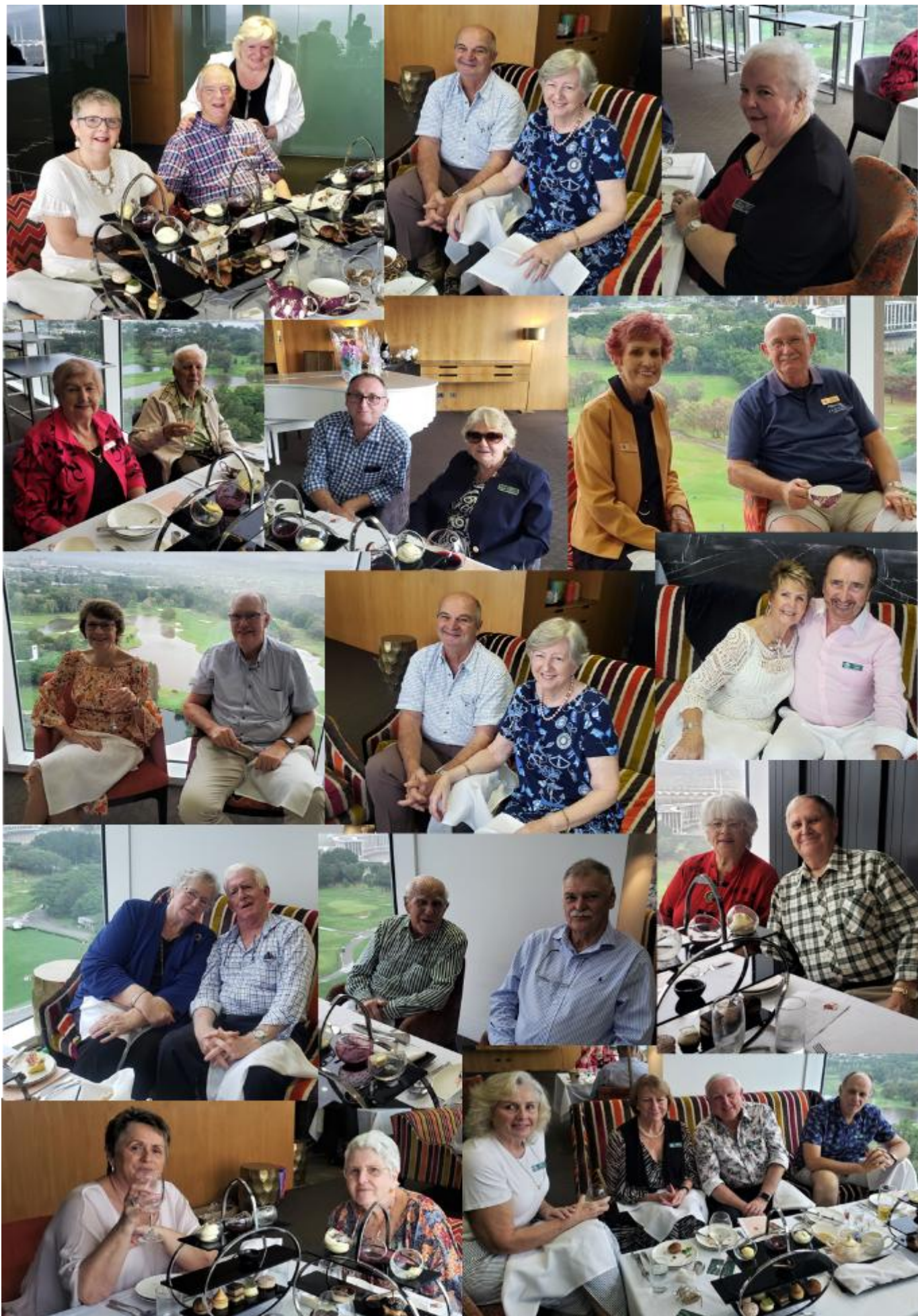
High Tea at the RACV Royal Pines Resort