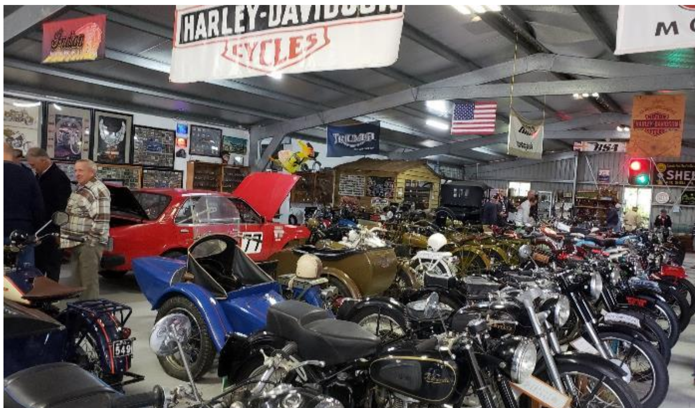
Morning Tea at the Roadvale Motorcycle Museum

Details of the Chairman' Weekend Away to Glenn Innes are shown on page 3.