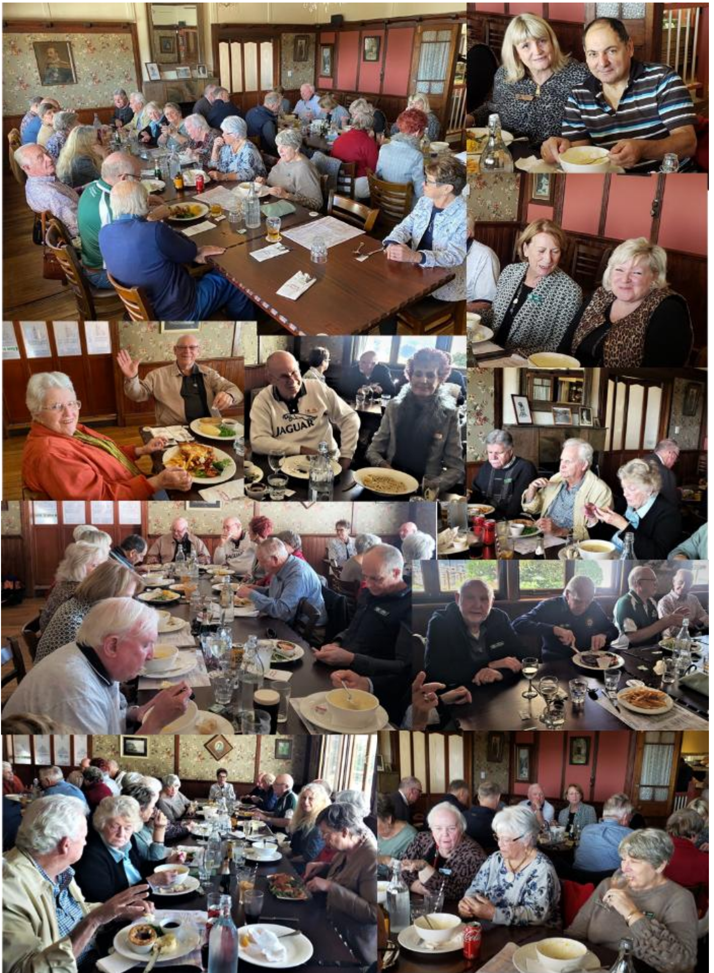
Lunch at St Bernard's Hotel Mt. Tamborine