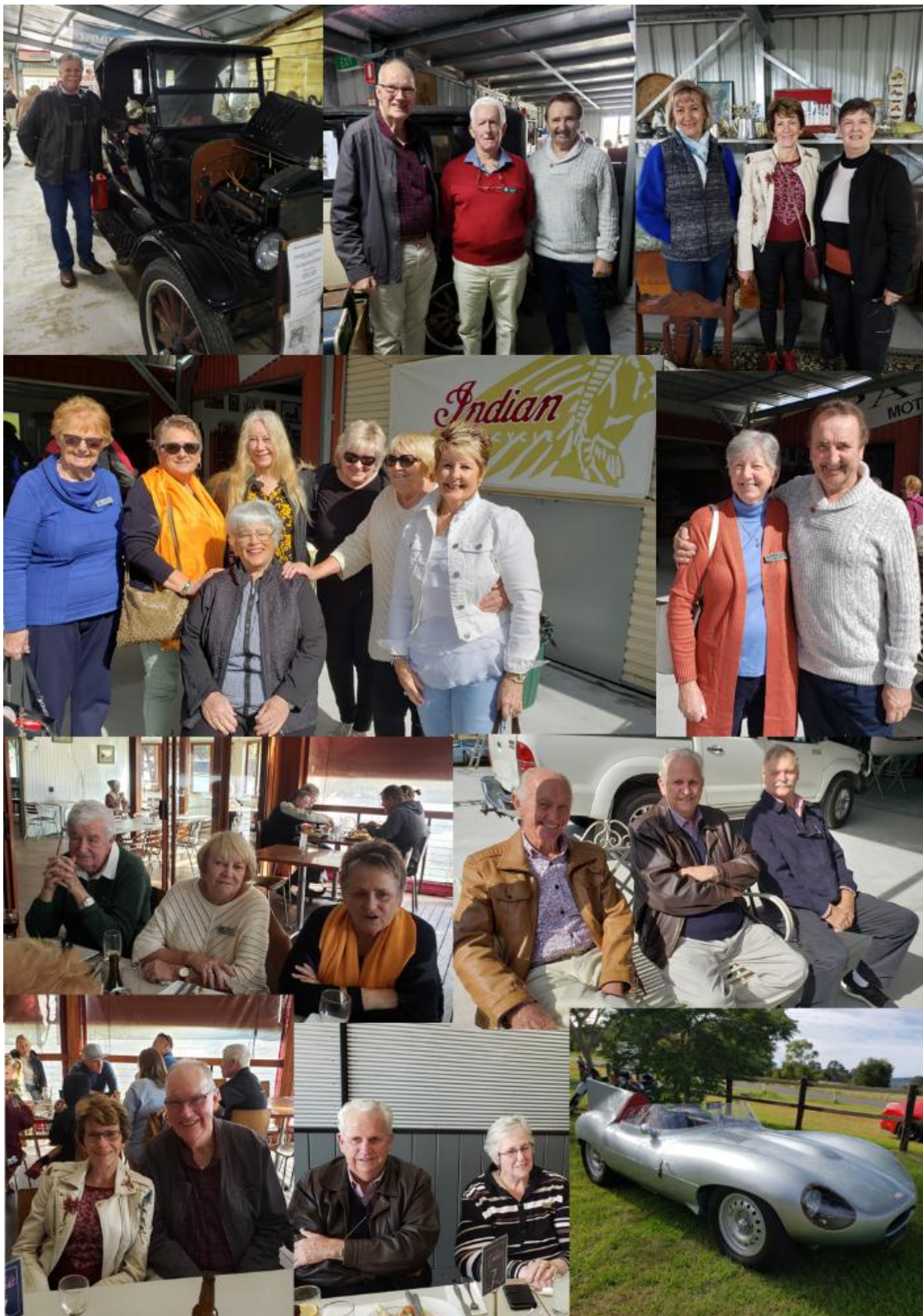
Visit to the Roadvale Motorcycle Museum and Lunch at the Kalba Hotel