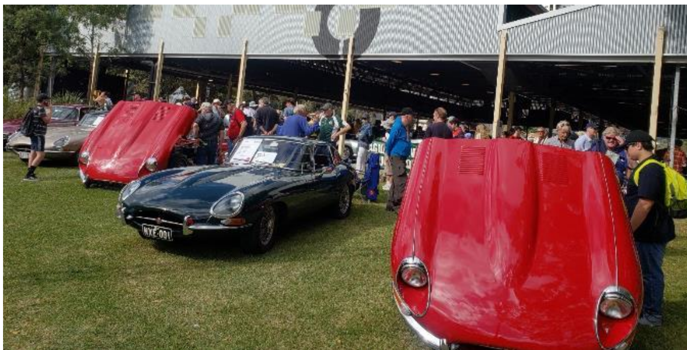
Jaguar Display at the RACQ Motorfest