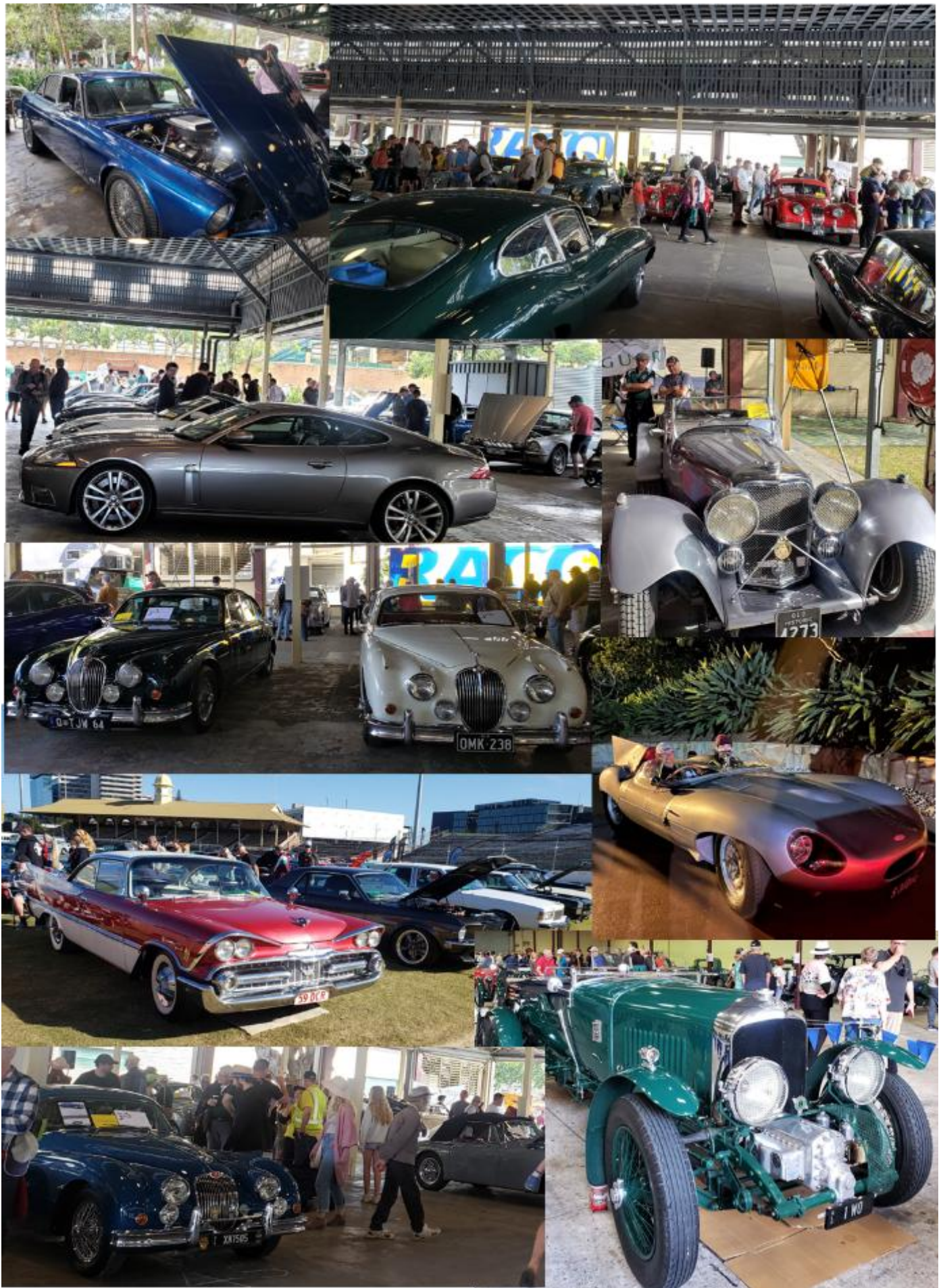
RACQ Motorfest Display in Brisbane