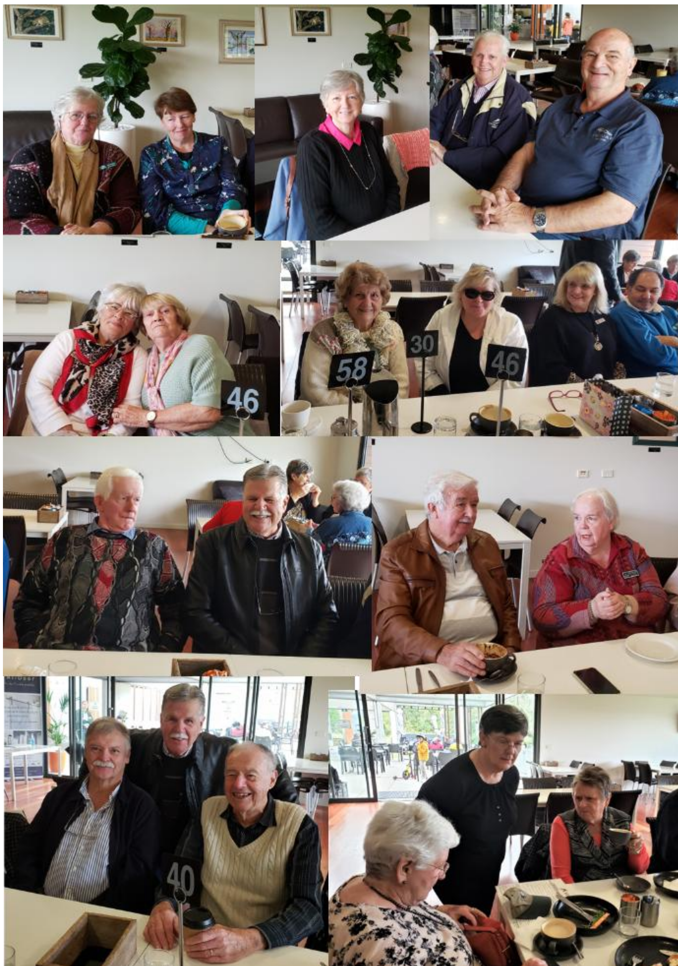
Brunch at the View Café, Hinze Dam