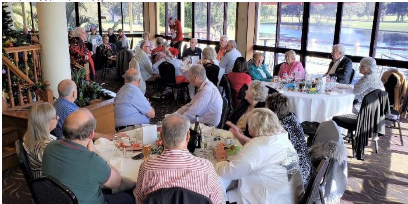
Christmas in July Function at Palmer Colonial Golf Course