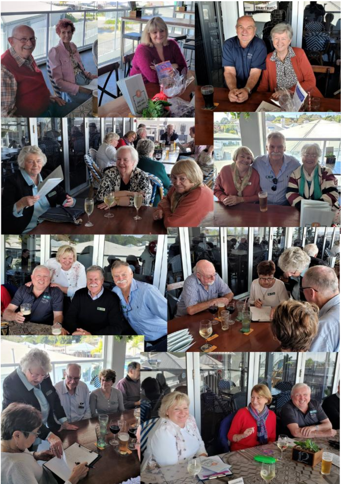
Lunch at the Pavilions Hotel, Terranora NSW