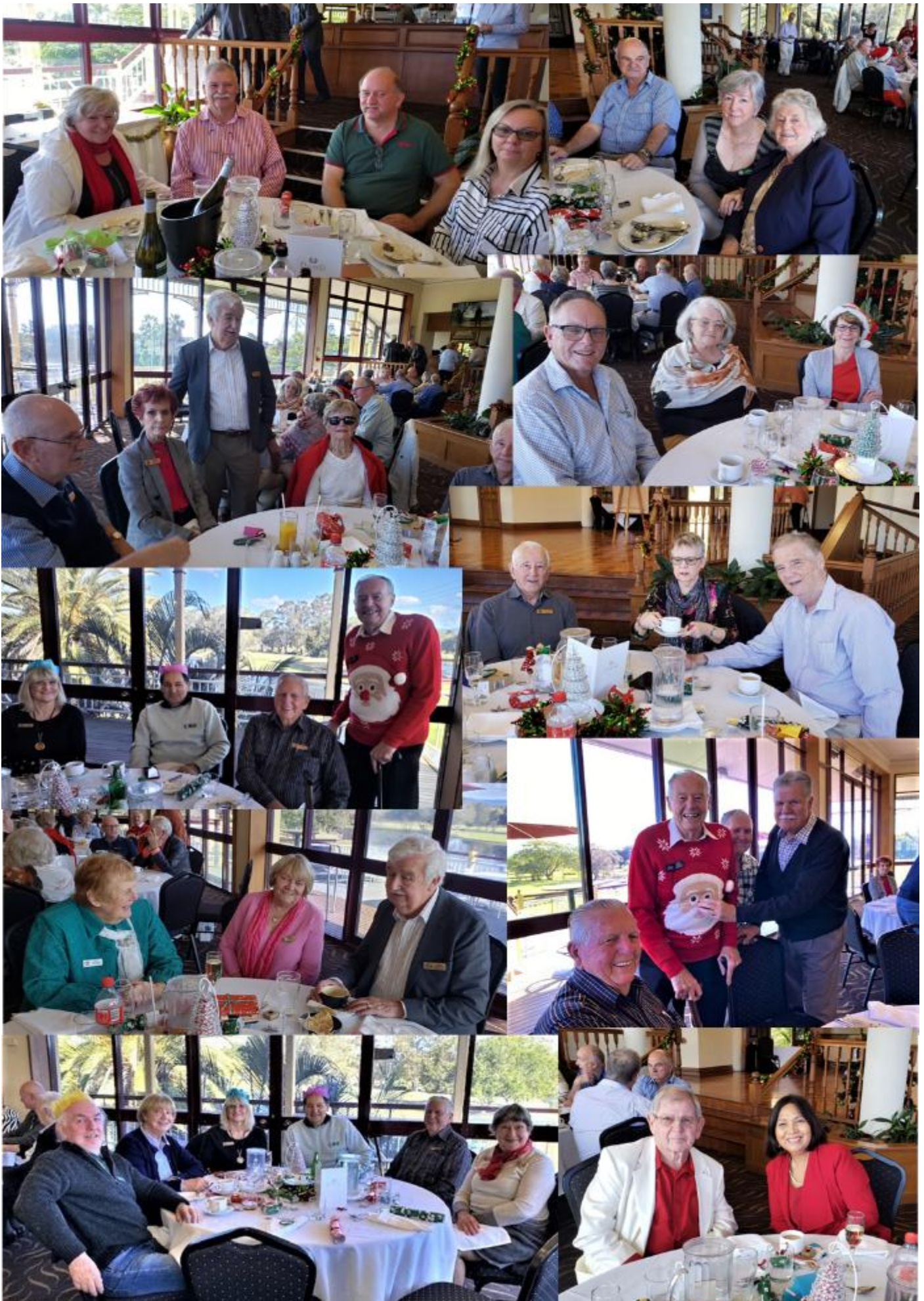
Christmas in July at the Palmer Colonial Golf Course