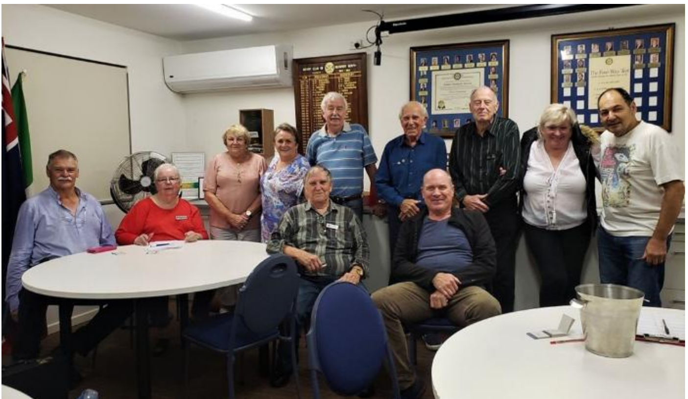
Members at our new meeting venue on a very rainy night

Note: REGISTRATIONS CLOSE FRIDAY 13 TH MAY.