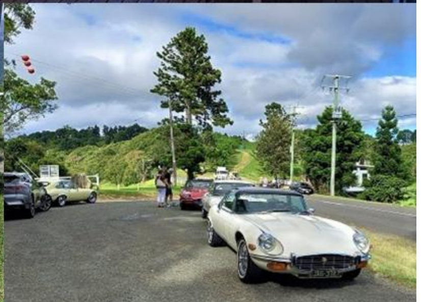
E & F Type Register Run to Beechmont