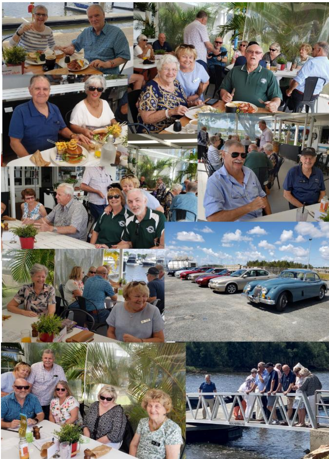
Brunch at the Anchorage Café in Steiglitz (including feeding the fish)