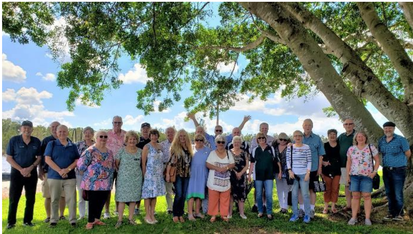
Members at the Anchorage Café Steiglitz

Lunch at St Bernards Hotel Mt. Tamborine. Details next month.