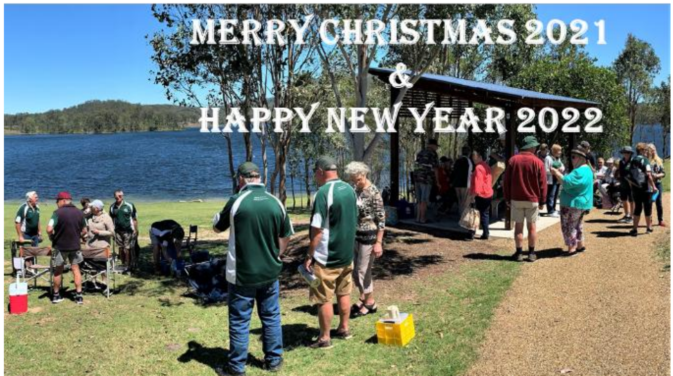
Gold Coast & Darling Downs Members at Wyralong Dam