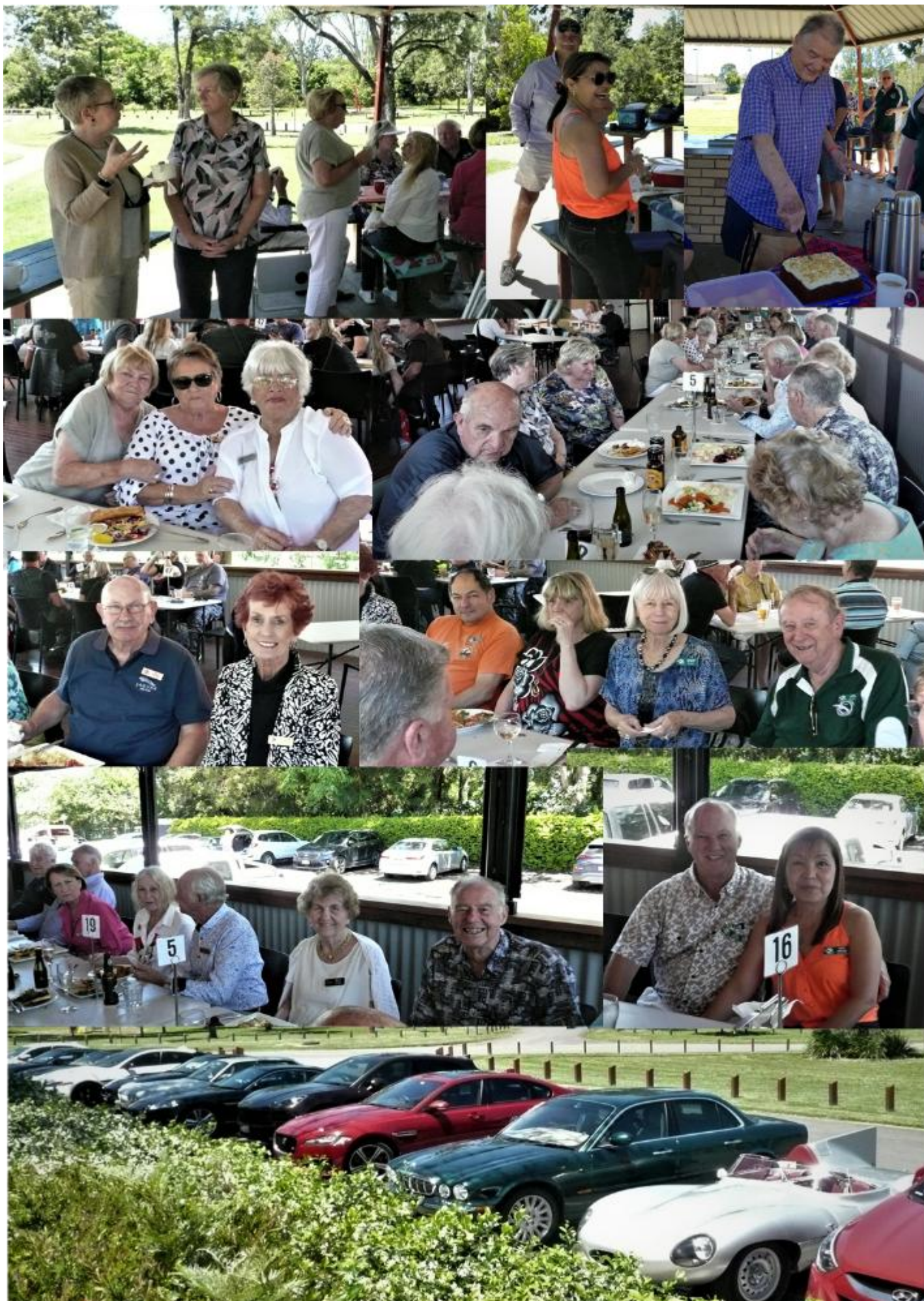
Lunch Run to Harrisville Hotel