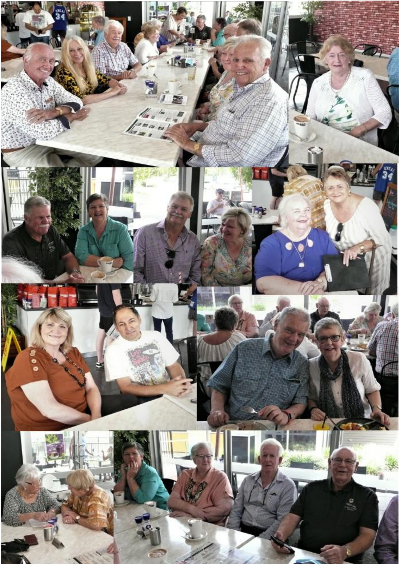
Brunch at Café 21 Upper Coomera