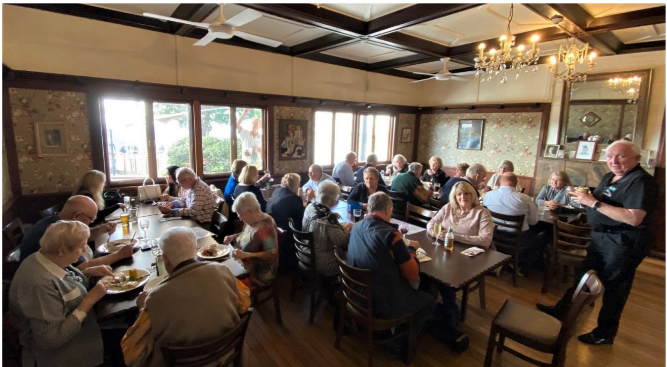
Lunch at St. Bernards Hotel, Mt Tamborine

Chairman's Gold Coast getaway to Glenn Innes. See page 6 for details.