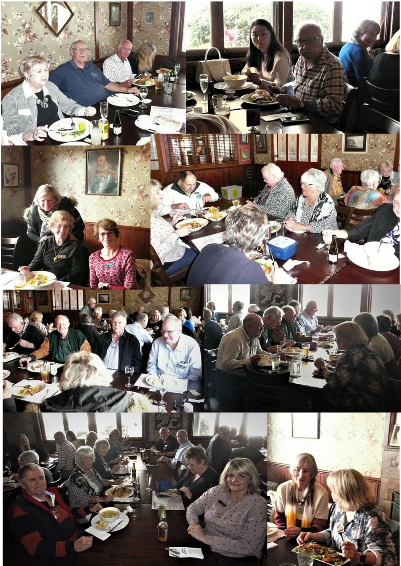
Lunch at St. Bernards Hotel Mt. Tamborine