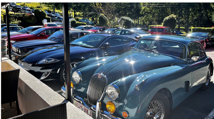
Our Display of Jaguars at the Fox and Hounds Hotel Wongawallan