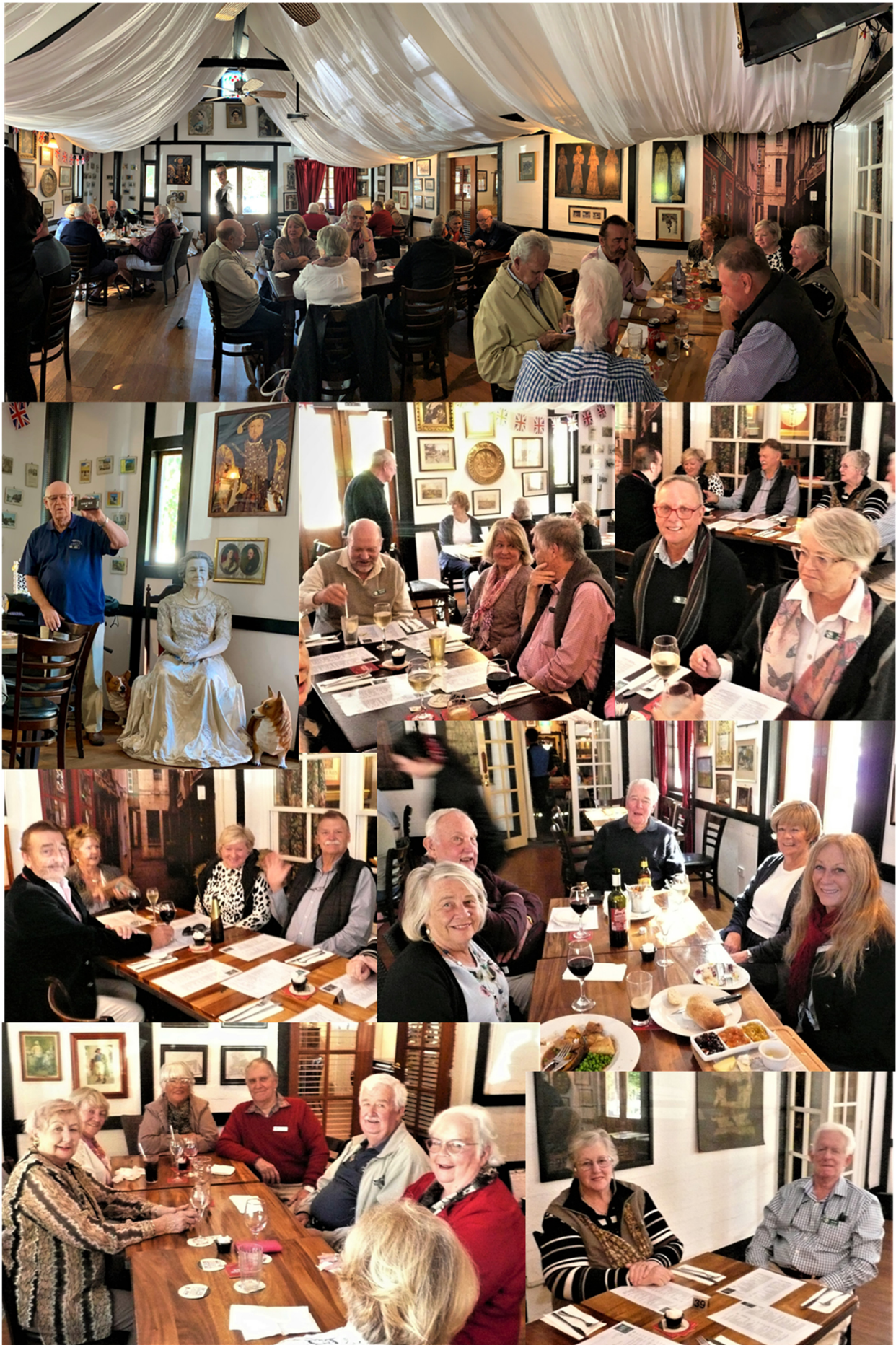
Lunch at the Fox and Hounds Hotel