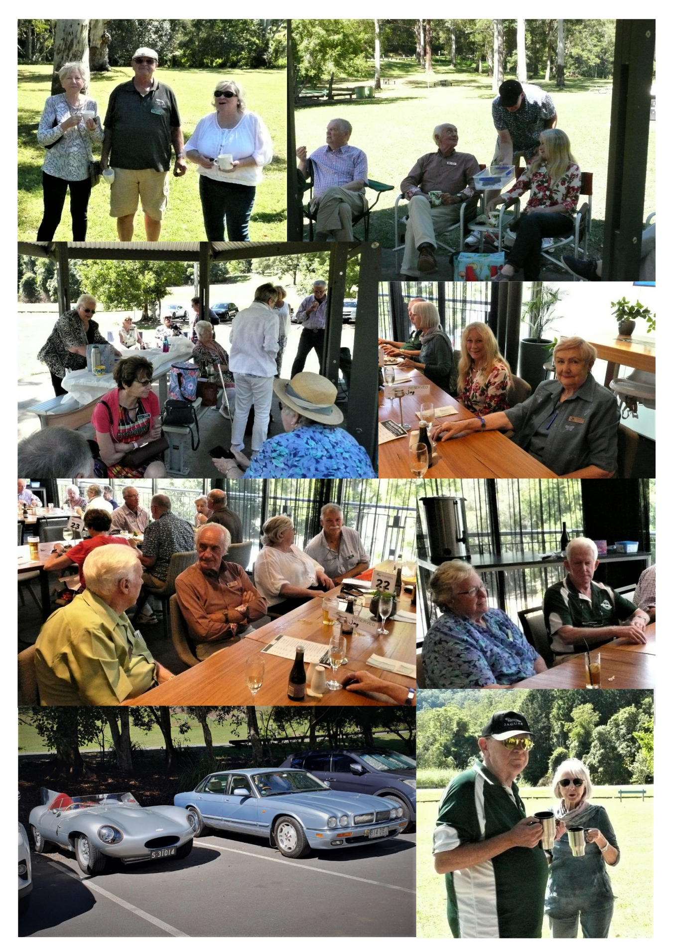
Lunch Run to the Murwillumbah RSL