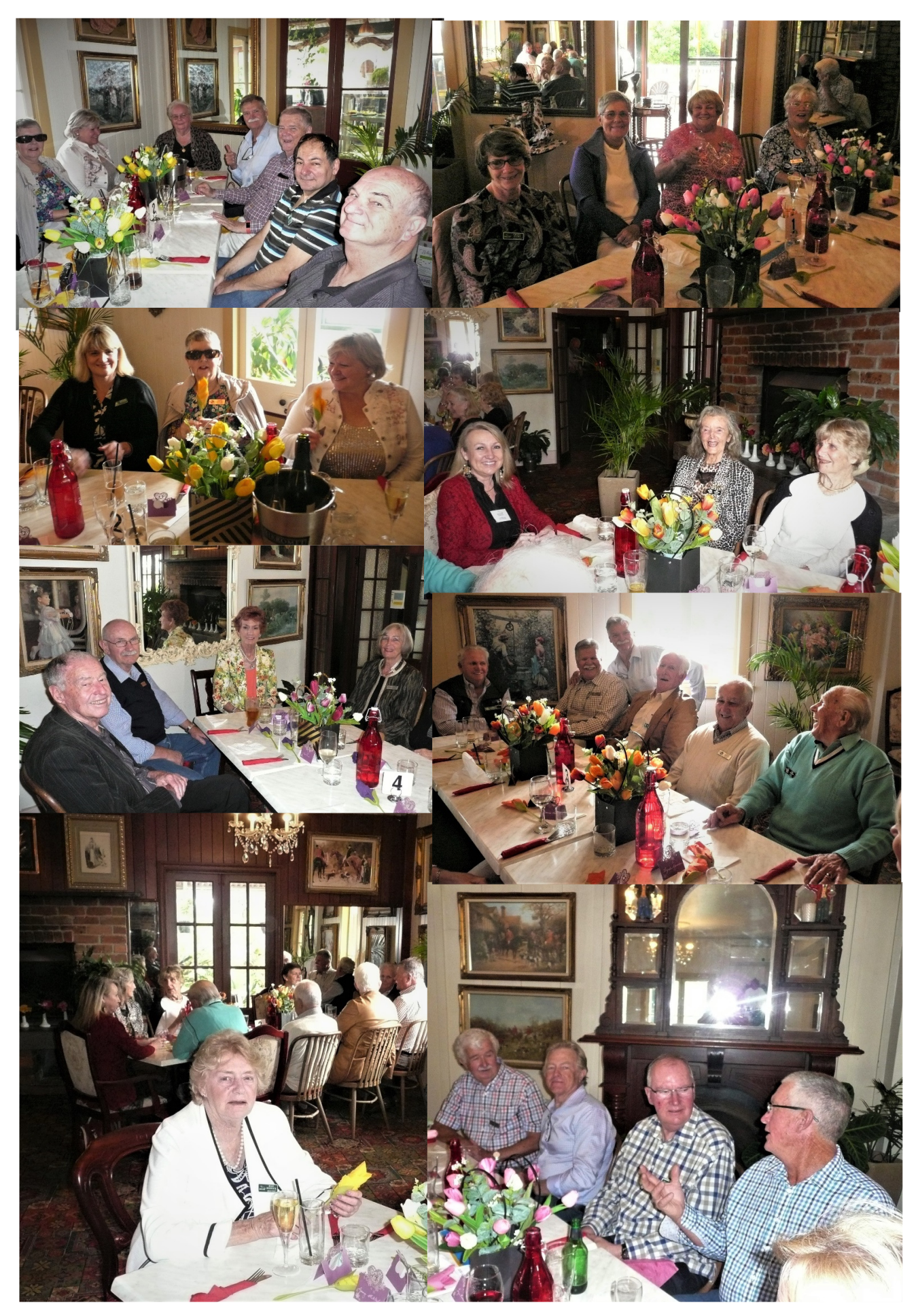
Spring affair Lunch at the Manor Mt. Tamborine