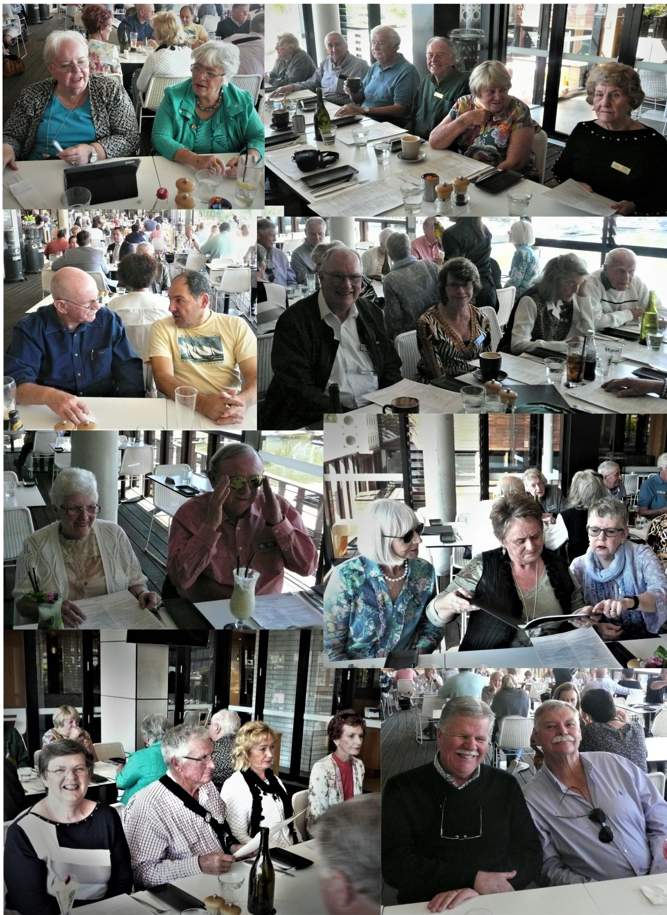
Lunch on the Isle of Capri