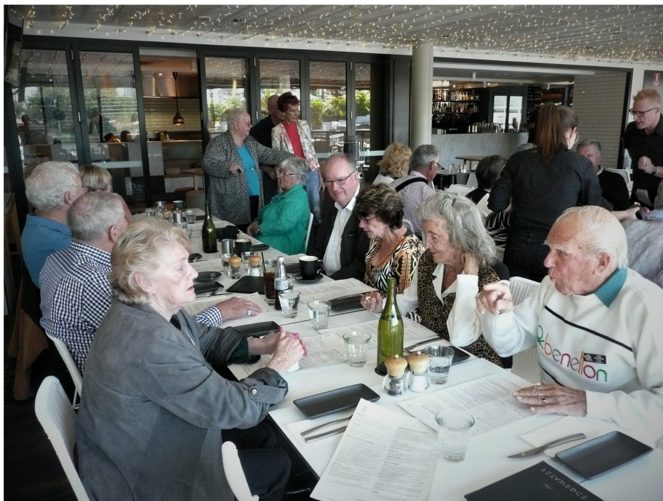
Members Enjoying Lunch on the Isle of Capri