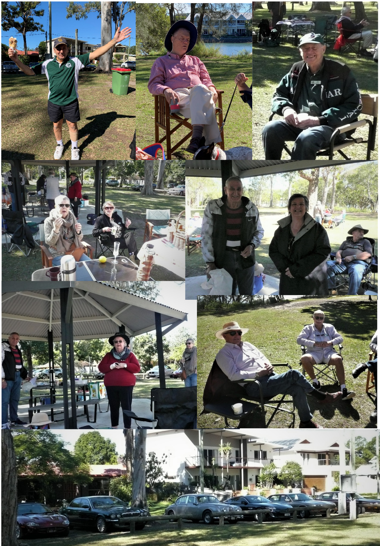
Picnic Brunch at Currumbin Creek