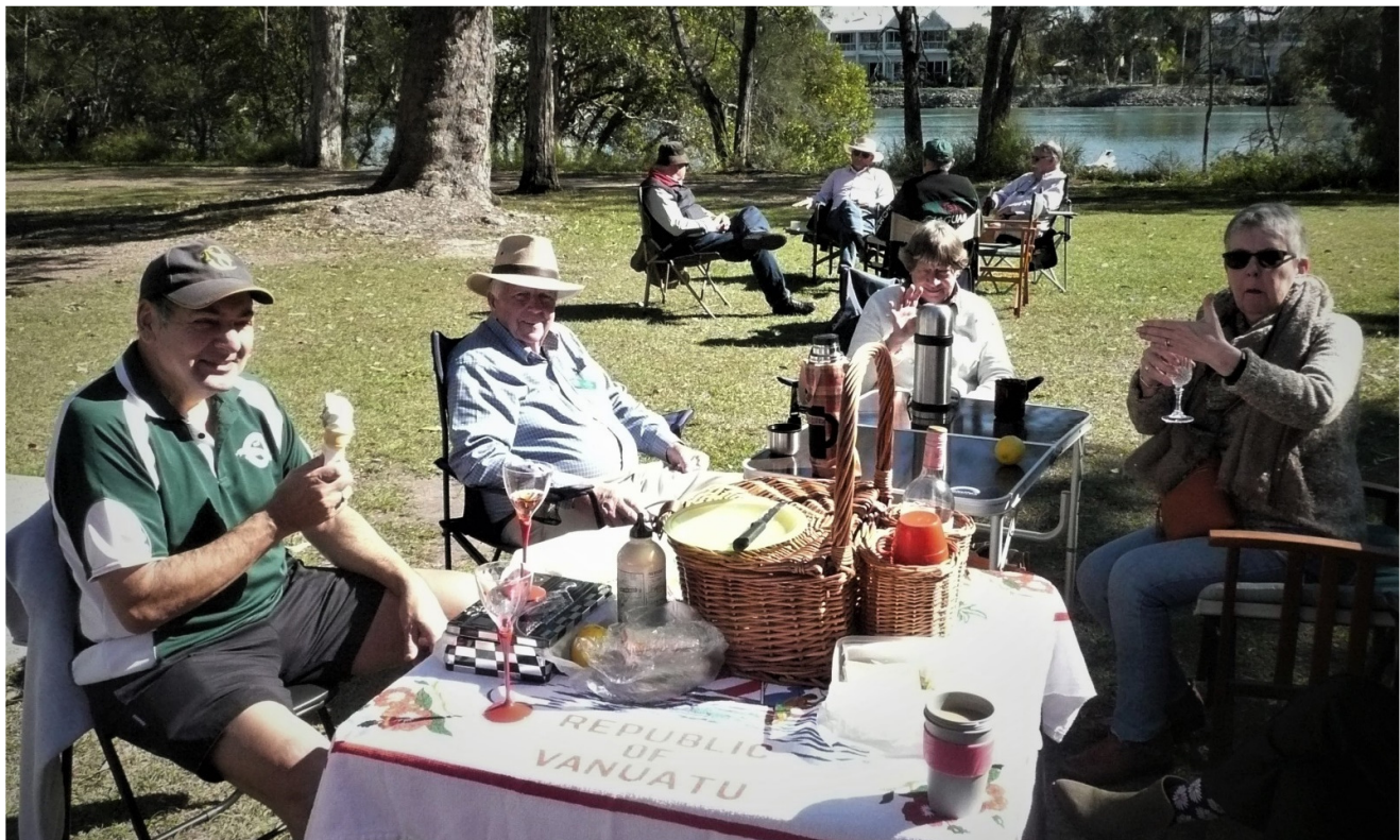
Picnic Brunch at Currumbin Creek Park in July

Meet At: Manor Restaurant 160 Long Road Mt. Tamborine at 11.45am.