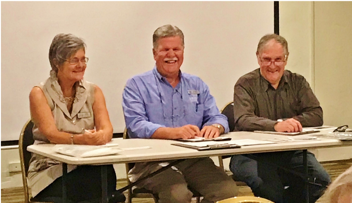
A Couple of Ring-Ins at the Top Table in September