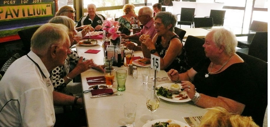
Wednesday Run to Kooralbyn Country Club