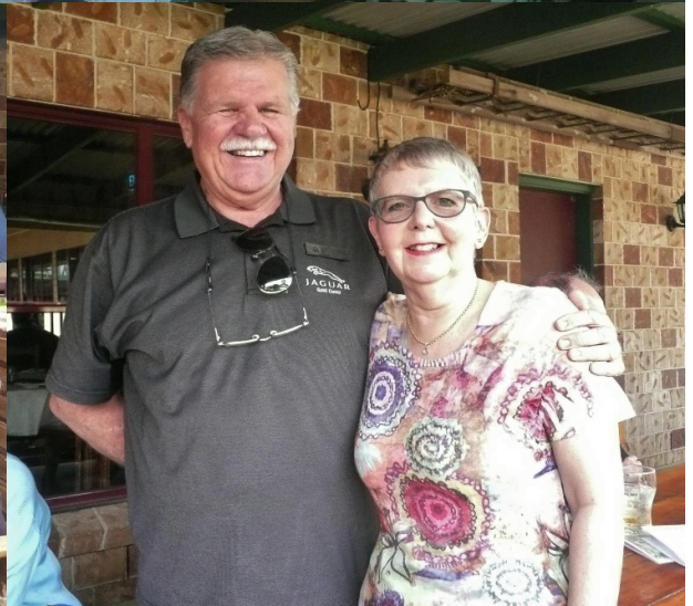
Lunch at the Bearded Dragon