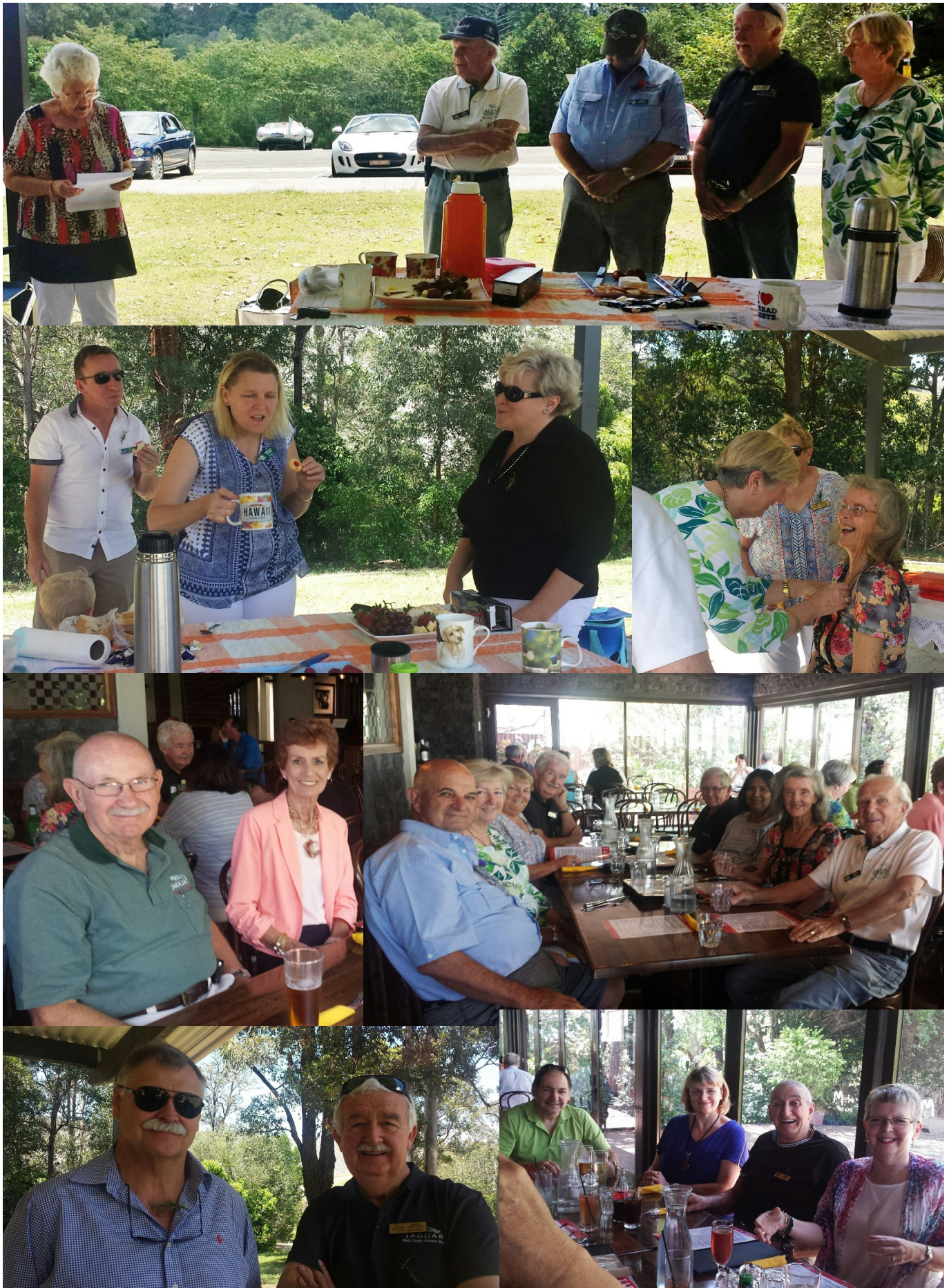
REMEMBRANCE DAY RUN TO MIKES KITCHEN