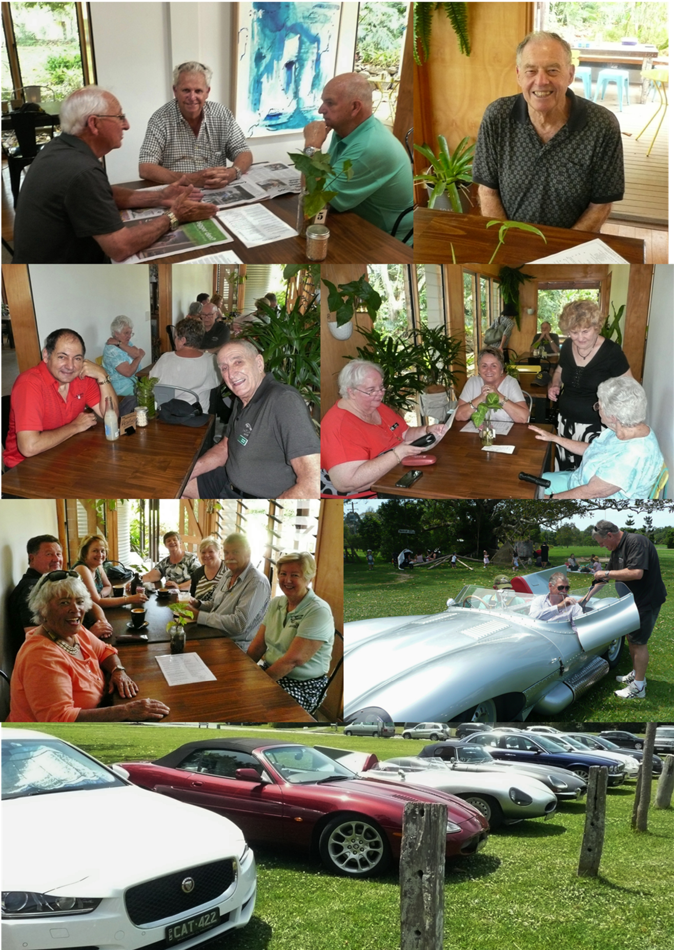
Wednesday Brunch at Pasture & Co Restaurant