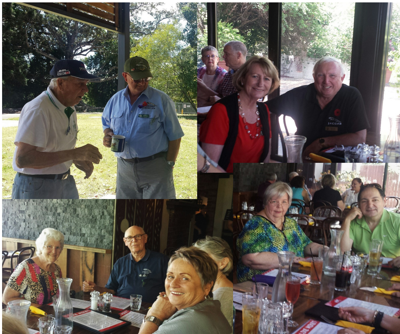
REMEMBRANCE DAY RUN TO MIKES KITCHEN