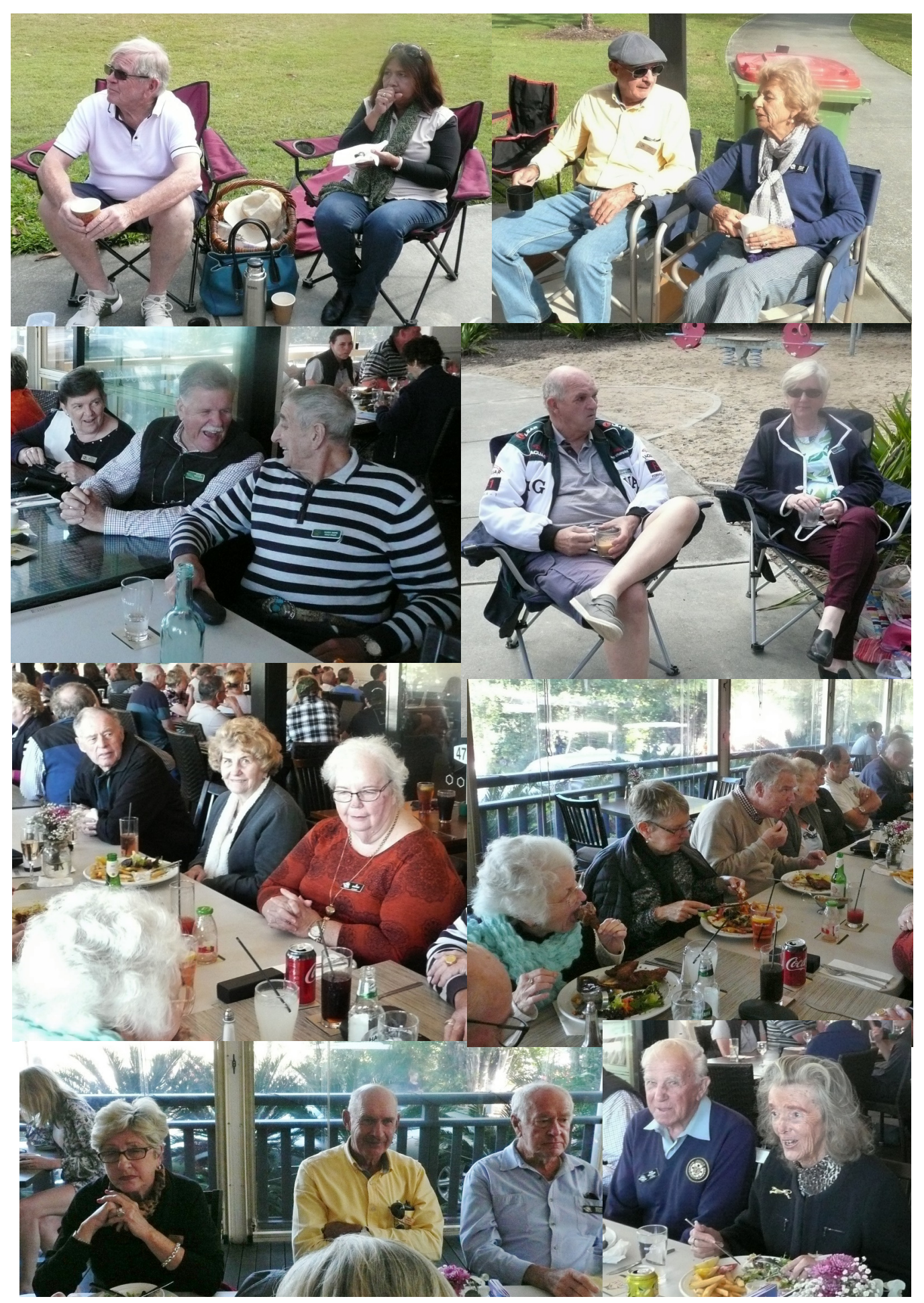
Lunch Run to Tallai Golf Club