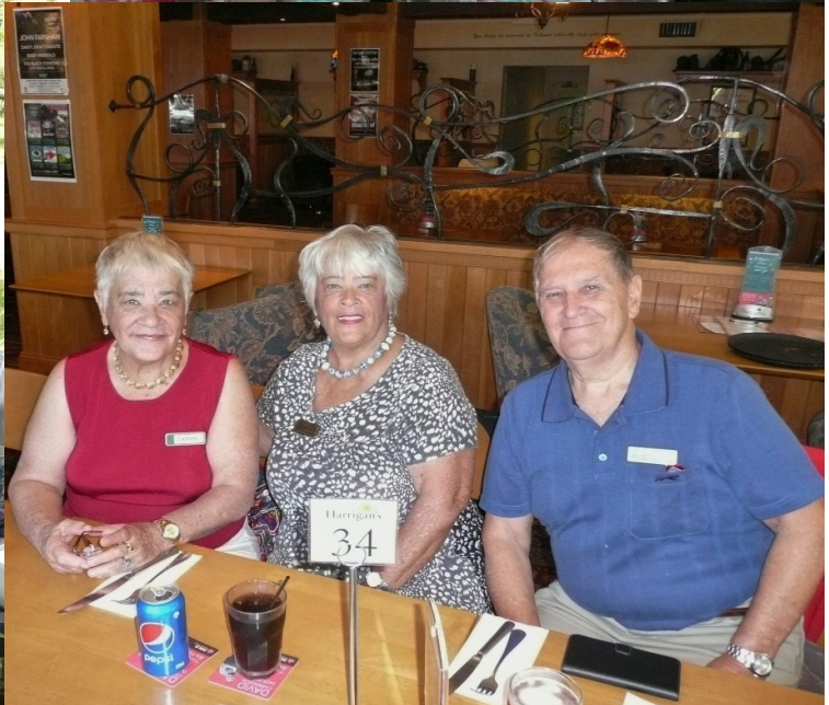
Wednesday Run to Harrigan's Tavern via Mt Tamborine