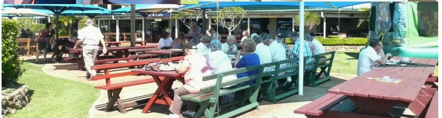
Breakfast At Eagle Heights Hotel Mt. Tamborine