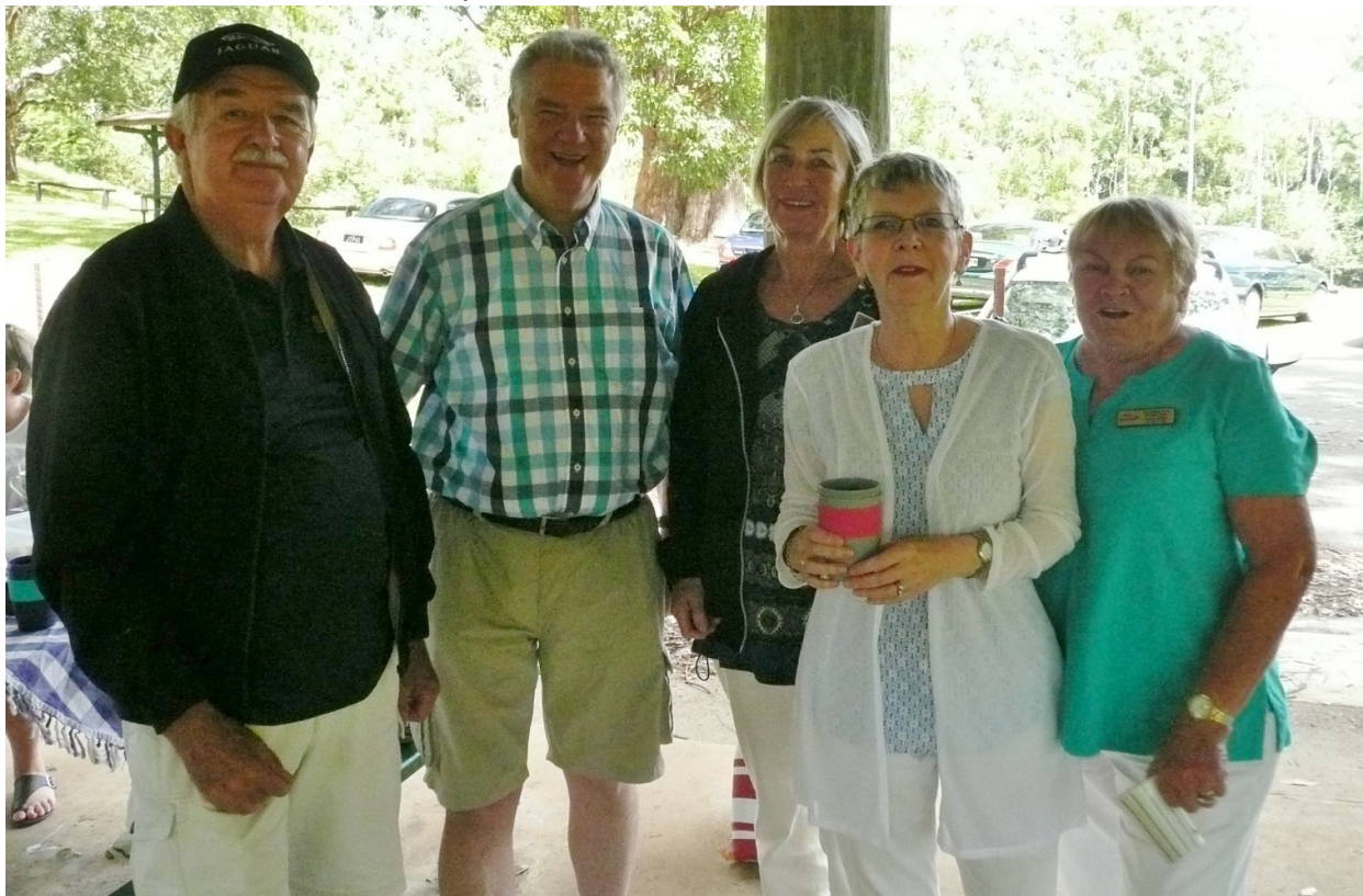
Morning Tea at Mt. Tamborine