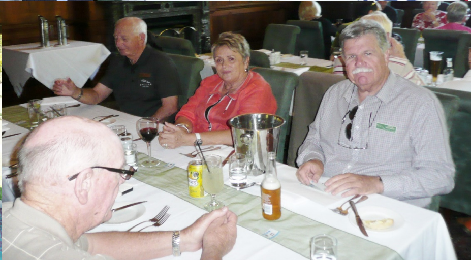
Sunday Lunch at Woodlands Resort at Marburg