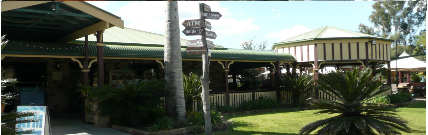
August Wednesday Run to Bearded Dragon Hotel