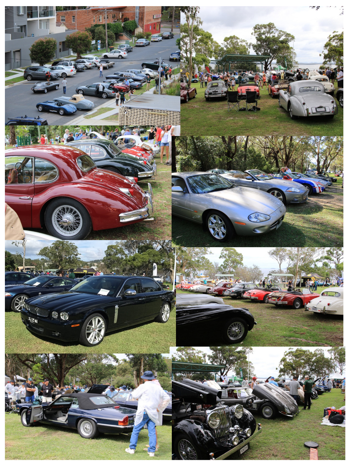
National Rally Display Day at Port Stephens 5