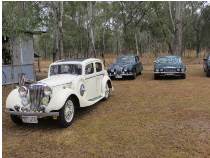
Contrast— SS ,S Type and XJ6