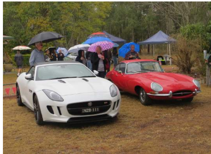
Contrast - F Type and E Type