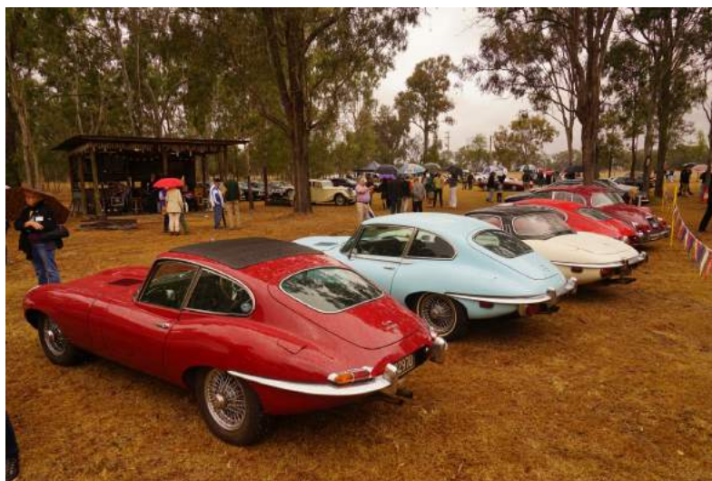
Just a few of the E Types