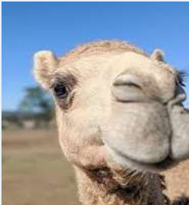
Those eyelashes have to be seen to be believed

Please note: it is vital we that we get at least 25 people committed to this drive or unfortunately it can not go ahead—so please RSVP to Neil by 9th October and pay by 1st November—details below.