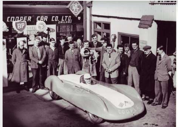
Early days at Cooper