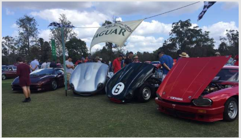
The winning line