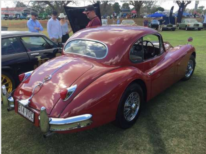
A beautiful 140