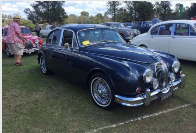
Brian Hine's MK2 - second place

Gleaming in that sunshine were many many jaguars particularly prominent being the MK2s enjoying their 60th birthday bash. At the start of the Jaguar display a chequered flag finish line greeted track bred race cars with bonnets open. One engine bay that was not open (no need -glass panels), was the power house super charged V6 in Jonathan McLeod's XJ220. When introduced the 220 was the world's fastest road going car. 220 giving a hint at its MPH top speed and unfortunately not many more than 220 were built. Jonathan's 220 won its class for the day and just as deservedly won the JDCQ best car award.