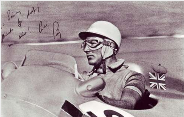
At one with the wheel—Stirling Moss

In the 60s “car shops” tapped into the growing market for “go faster” goodies and car accessories. A Moto Lita wheel was the crowning accessory. Aston Martin became the first firm to fit a Moto Lita steering wheel as standard in DB4/5, then came Jaguar, AC and Morgan.