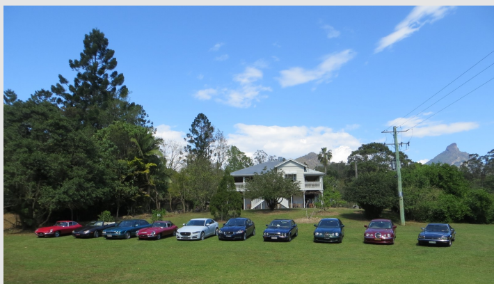
Our cars displayed in front of Mavis's Kitchen, Mt Warning