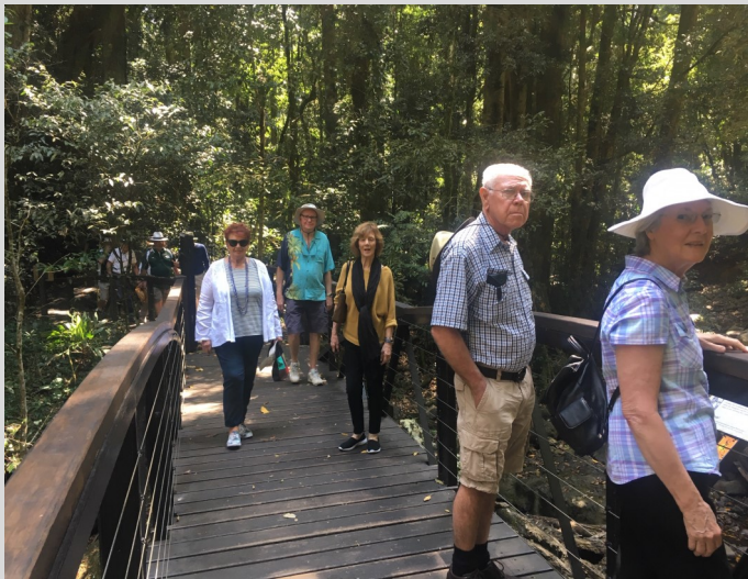
A beautiful rainforest walk at Natural Bridge