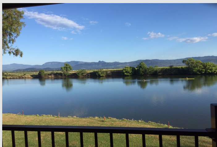
That view for Breakfast