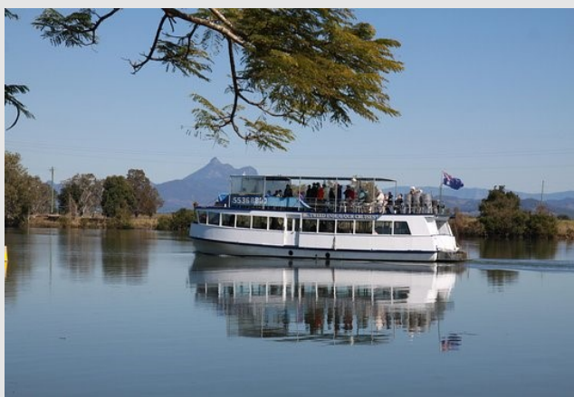
Cruising on the Tweed River (with a seafood dinner)

At the meeting point in Logan Village, Phil and Ruth briefed the group and handed out bags containing maps and directions for the weekend plus goodies to ease hunger pangs between food stops. First stop was the Hinze Dam where we were given a talk on the history of the dam and its role in the SEQ water grid before morning tea. Then a drive to Natural Bridge to walk off morning tea at this picturesque location. Next a 30 minute drive over winding scenic roads to Flutterbies café at Tyalgum for lunch before driving to our accommodation in Murwillumbah on the banks of the Tweed River. A shuttle bus transported us to the Riverview Hotel for the evening meal and we were back at the motel in time to watch one's preferred football code.