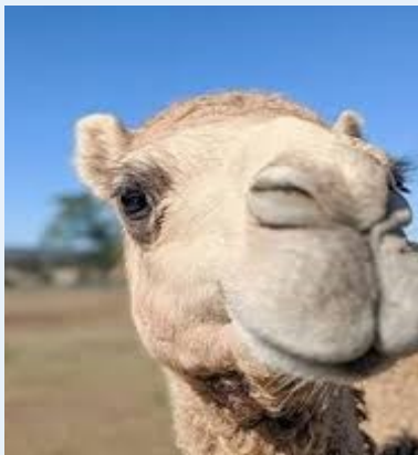
Those eyelashes have to be seen to be believed

Please note: it is vital we that we get at least 25 people committed to this drive or unfortunately it can not go ahead—so please RSVP to Neil by 9th October and pay by 1st November—details below.