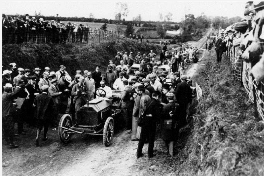
The first Gordon Bennett Cup was between Paris and Lyon

Promoting the newspaper James Jr. established various international competitions. The Gordon Bennett Cup for yachting—The Gordon Bennett Cup for ballooning, ditto aircraft racing and weighing in at 17kgs of solid silver was the Gordon Bennett Cup for motor racing. The motor racing cup's first competition was in France 1900. Nations could submit 3 cars built entirely in their own country and running under their own colours. The first teams came from France, GB, USA, Germany, Austria, Switzerland, Belgium and Italy. The race ran from Paris to Lyon. Fernand Charon won the race with a Panhard and so France won the right to stage the next year's event. The 1901 race was run from Paris to Bordeaux but was quite a shambles—indeed 8 people were killed including 2 drivers.