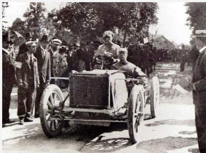
Selwyn Edge driving in the 1902 Gordon Bennett Cup

So the exclamation "GORDON BENNETT" means— goodness gracious, whatever next, how could it be so, recalling some of the exploits of the man who gave the world international motor racing.