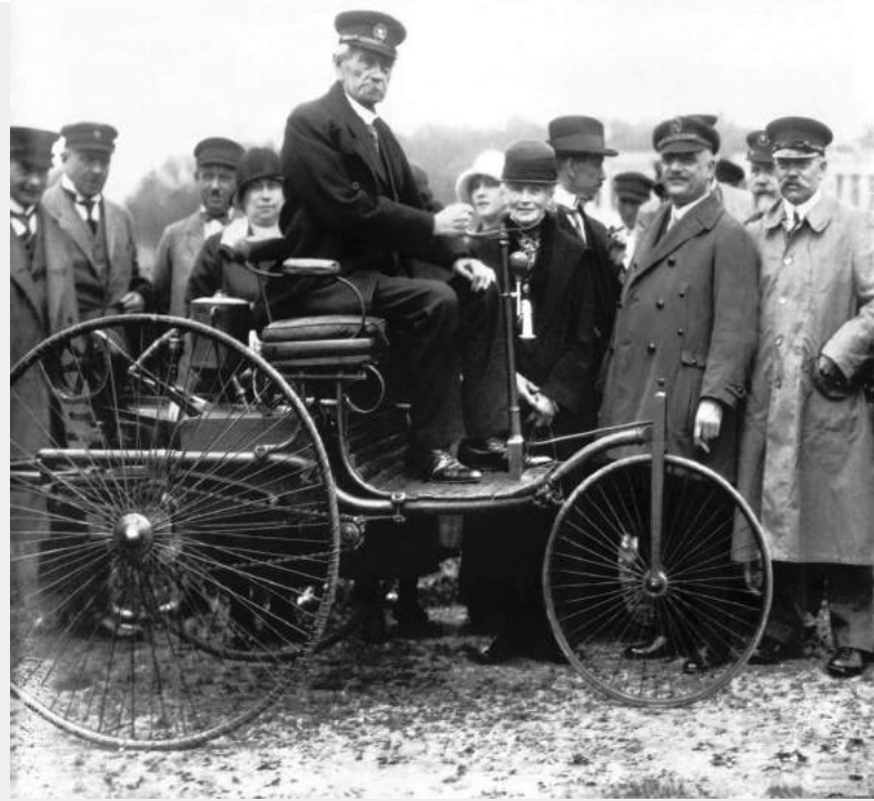
1885 Karl with Bertha at his side with the first Motor Car

Ps . What's in a name: "Benzine"..... Yes you guessed it - it was named after Karl.