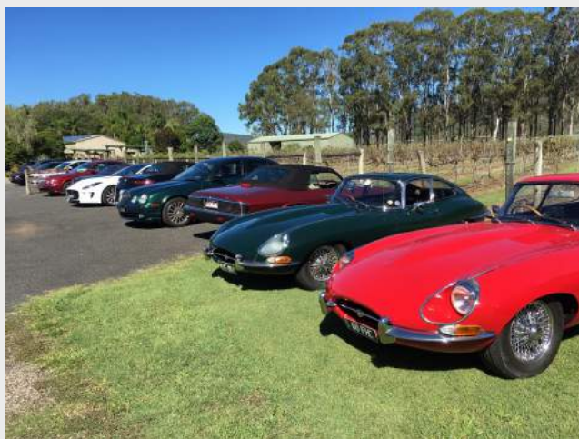
Just a small sample of the cars to view