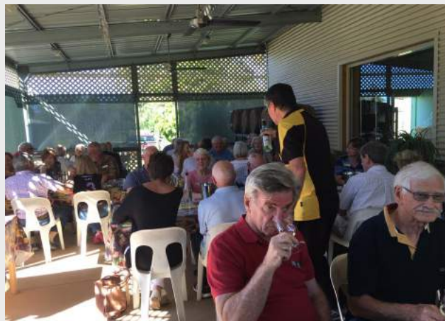
A little bit of tasting combined with humorous poetry