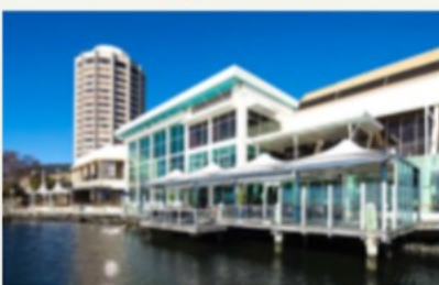
West Point Casino