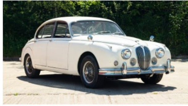
Lot No. 368 - 1961 Jaguar Mk 2 3.8 Manual

With less than 33,000 miles from new, this stunning Series 3 V12 appears to tick every single box.