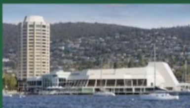
West Point Casino