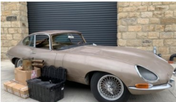
Lot No. 370 - 1966 Jaguar E-Type S1 4.2 FHC Manual (LHD)

Classically presented, left-hand drive, Mk 2 on a NOVA, a perfect recommissioning project.