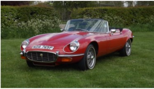
Lot No. 357 - 1975 Jaguar E-Type S3 Roadster