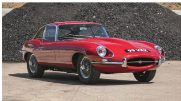
Lot No. 351 - 1967 Jaguar E-Type S1.5 FHC