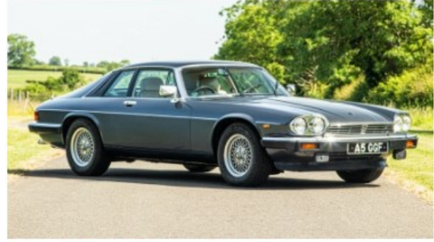
Lot No. 304 - 1990 Jaguar XJ-S HE Auto

There can't be many examples of the elegant XJ40 in this condition and with less than 7,500 miles.