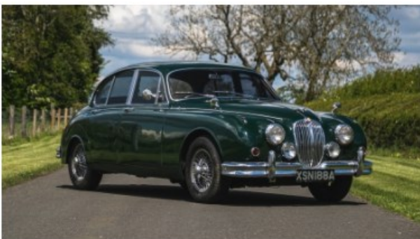
Lot No. 346 - 1963 Jaguar Mk2 3.8 Manual O/D

Lovely V12 HE in gleaming Black with low mileage and interesting history.