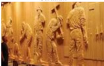
The Wilderness Wall