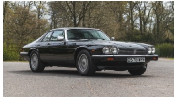
Lot No. 345 - 1986 Jaguar XJ-S HE 5.3 Coupe (57,000 miles)

A superb example of the rare, two-seat, Targa-topped, XJ Cabriolet.