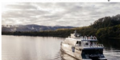
Gordon River Cruise