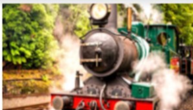
The West Coast Railway