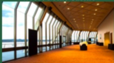
Friday Night Welcome