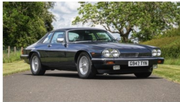
Lot No. 377 - 1989 Jaguar XJ-S 5.3 V12 Auto

Amazing restoration opportunity. Series 1, final year, hugely original and never restored from 40 years of slumber.