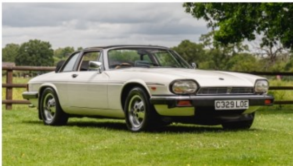
Lot No. 322 - 1986 Jaguar XJ-SC V12 5.3

These superb 'Grand Tourers' are enjoying an increasing following and are wonderful value for money.