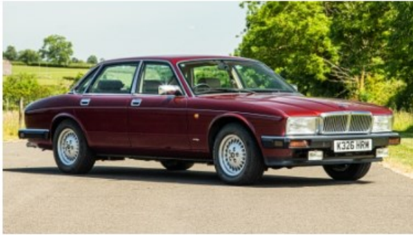
Lot No. 302 - 1992 Jaguar Sovereign 3.2 Auto