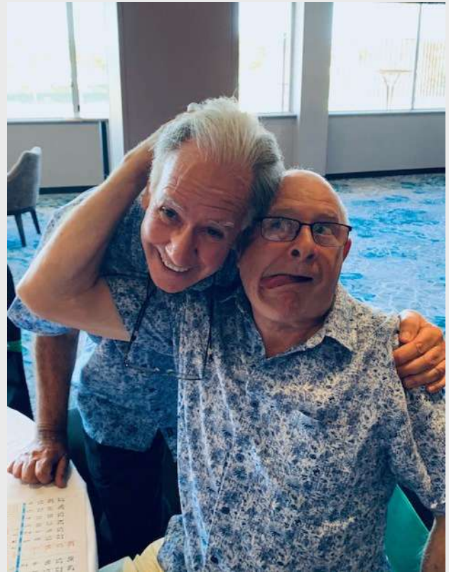
Very fashionable Shirts