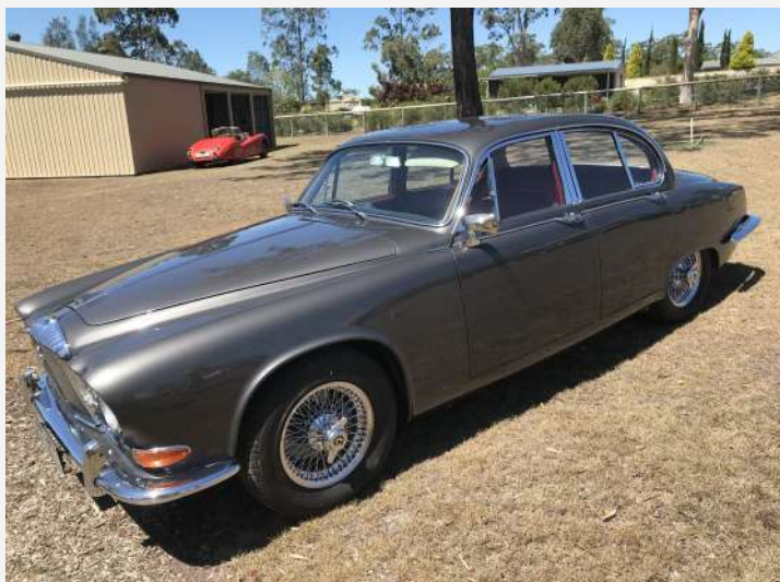
Daimler 420 Sovereign