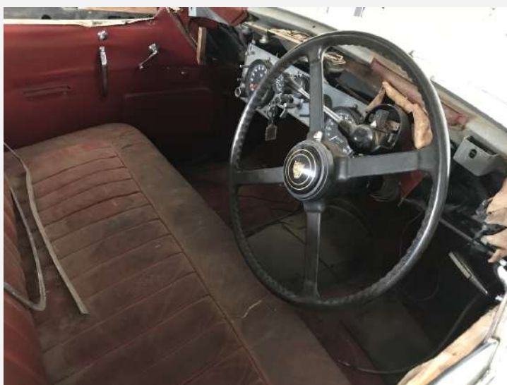
Mark 8 interior