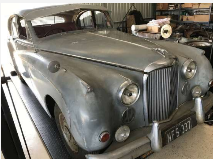
Mark 8 Barnfind