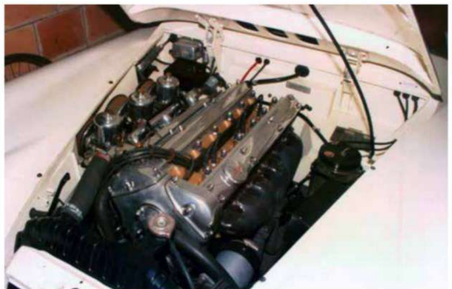
Triple SU's and all tidy

I followed; still without a rear window in the car. She kept on the next day about her idea of putting the glass in the rubber first, so I thought the only way to settle this argument was to show her