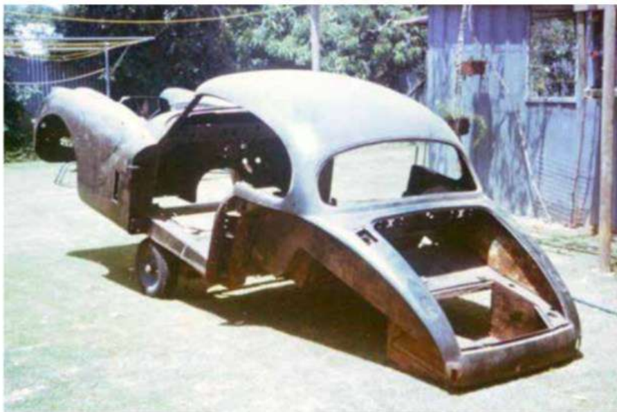
Almost down to the essentials.

The vehicle was stripped of all easily removable items, doors, seats, trim, etc., making adequate (?) notes all the time, so it could be reassembled again in the not so distant (?) future. Then, the first problem became evident, where was I going to store all this stuff?