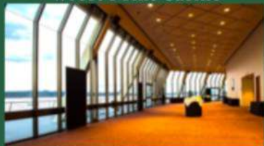
Friday Night Welcome