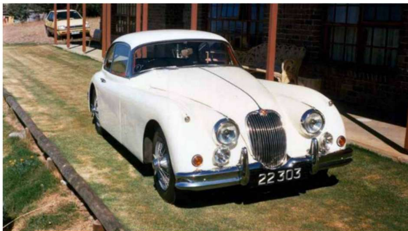
All finished and proud of it too.