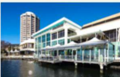
Wrest Point Casino