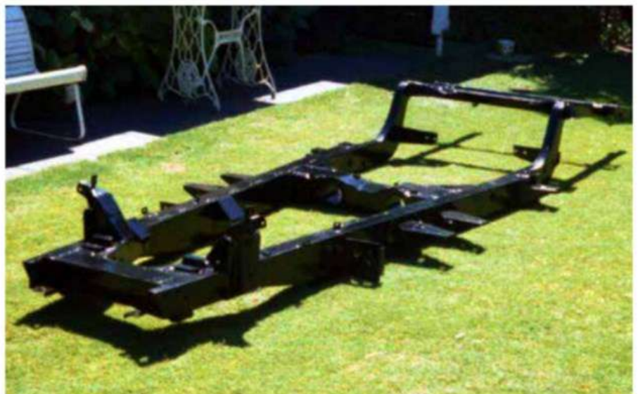
The project begins!

After the half shafts were straightened, and new threads cut, the rear end went together very nicely. The original brake cylinders (on the front only, I never found the rear ones) were frozen solid, and were the outdated, round pad variety anyway. So square, quick-change pads, calipers and cylinders from a Mk II were fitted, and after building up and machining the splines on the hubs, I had a chassis on wheels.