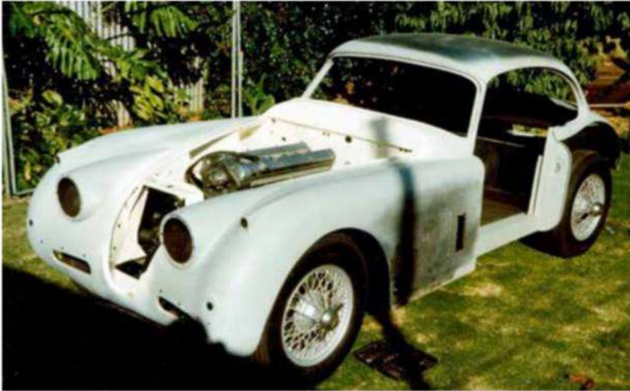
Almost there - Just the doors, bonnet, grille, glass, interior, woodwork, rear guards. Yikes!

After some minor reshaping, the carbies went back on, and with the radiator fitted, fuel connected, steering column installed and some primitive wiring, I had to have a drive around the back yard!