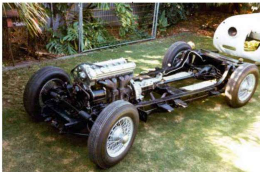
Mechanical's rebuilt - now time to start the body.