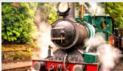
The West Coast Railway