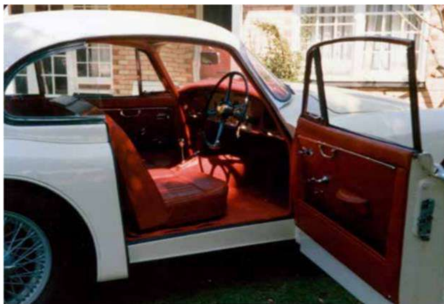
The red leather and carpets look fabulous.

It took countless hours over a period of four years to restore, and I decided fairly early in the exercise not to record the