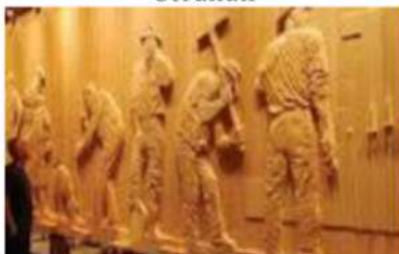
The Wilderness Wall