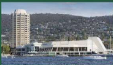
Wrest Point Casino