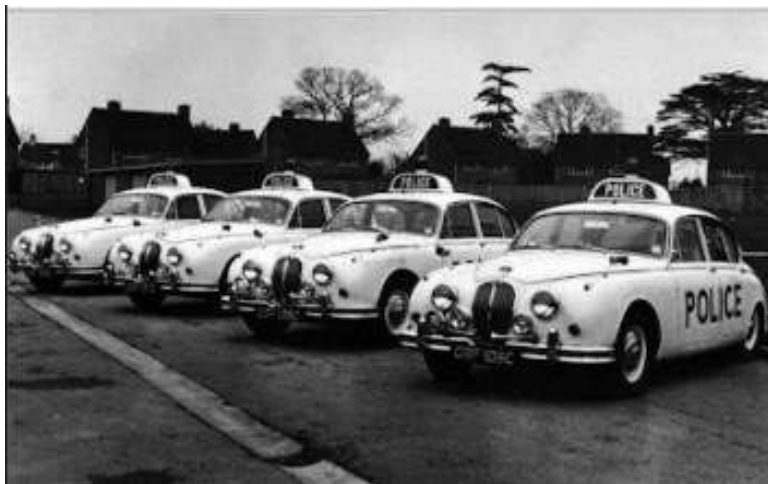
Did good cops get white cars and bad cops get black ones?