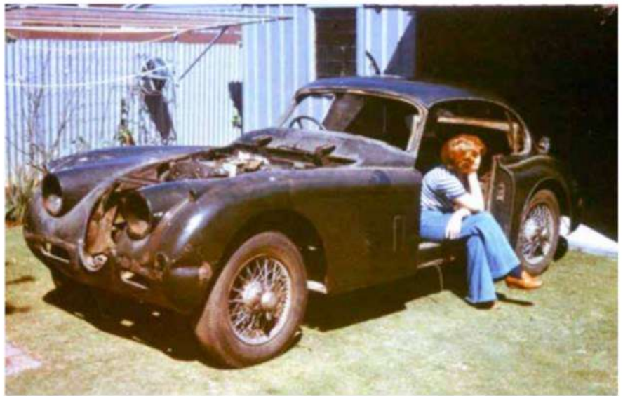
Every picture tells a story

Apparently it wasn't stopping too well and the rear brakes were causing trouble. So, off came both rear calipers which were disposed of. Who needs rear brakes anyway - it's the front ones that do all the work isn't it?