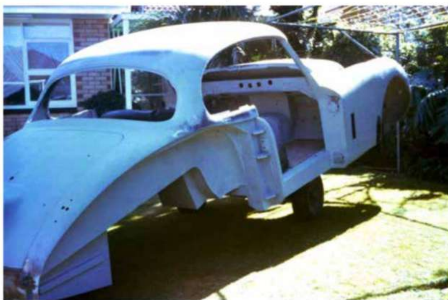
Work begins on restoring the body!

Everything lined up with the exception of some body modifications I had made to fit the triple SU's.