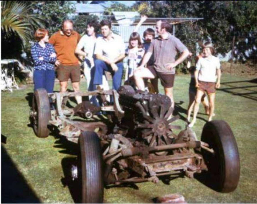
There is only one way from here - up!

It's surprising how much room seats, battery boxes, doors, lids, windows, mudguards, dashboards, floors, a gear box, bumper bars, a radiator, etc., take.