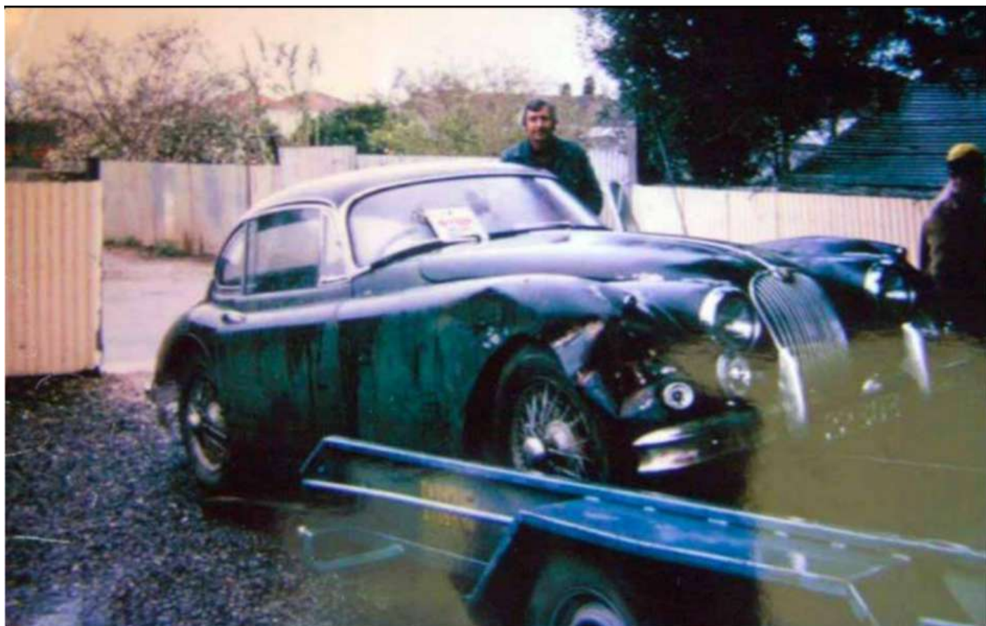
Day 1 - the XK150 arrives for restoration

Editor- The following story by Onslow Billingham appeared in Classic Marque in 1985. It is such a good story that we felt it deserved another run. Enjoy!