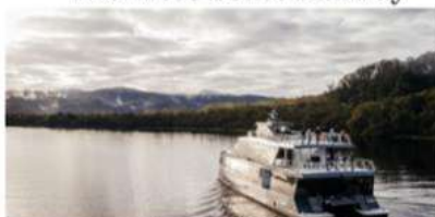
Gordon River Cruise