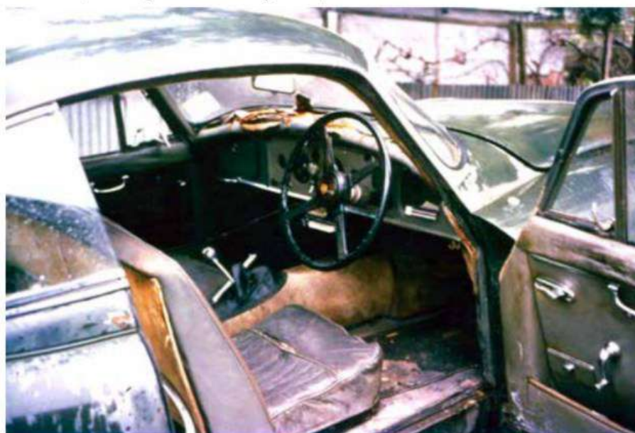
The interior was at best very sad.

After some research this is what Slim had bought. The car, an early 1958 3.4 litre FHC with wire wheels, but without overdrive, was purchased by prominent