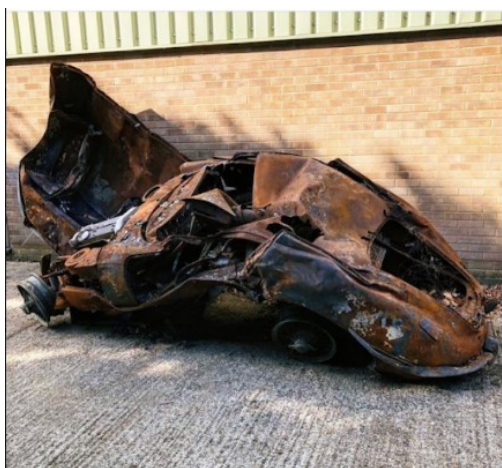
The parts list. They restored it.