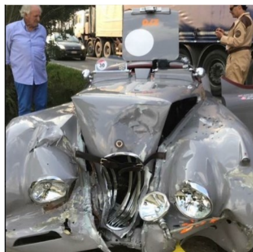
Previously restored and it's his fault.